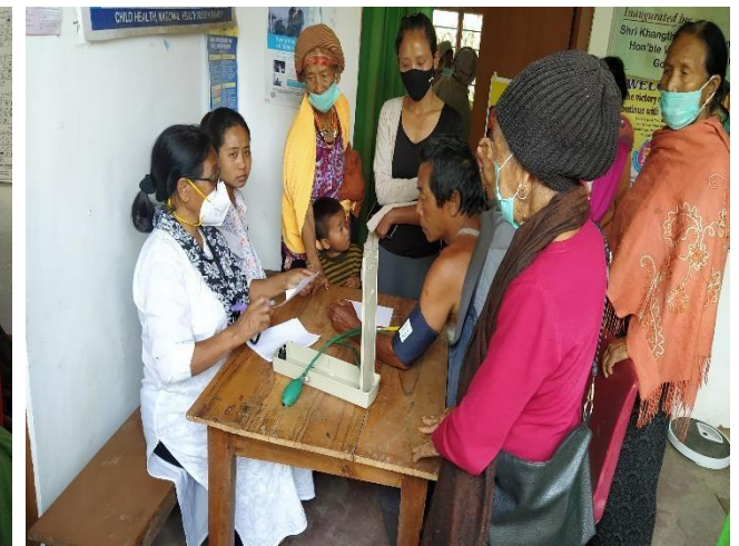
Medical health check up by the doctors in the camp.