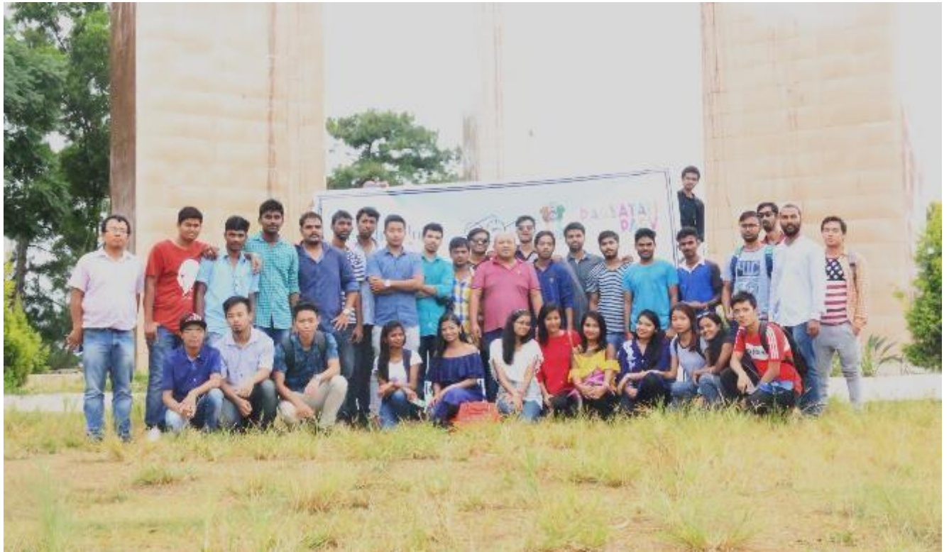
Unnat Bharat Abhiyan, NIT Manipur team visiting the adopted villages