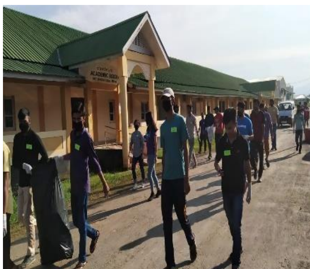
Sharmdan and declaration of plastic free campus at NIT Manipur