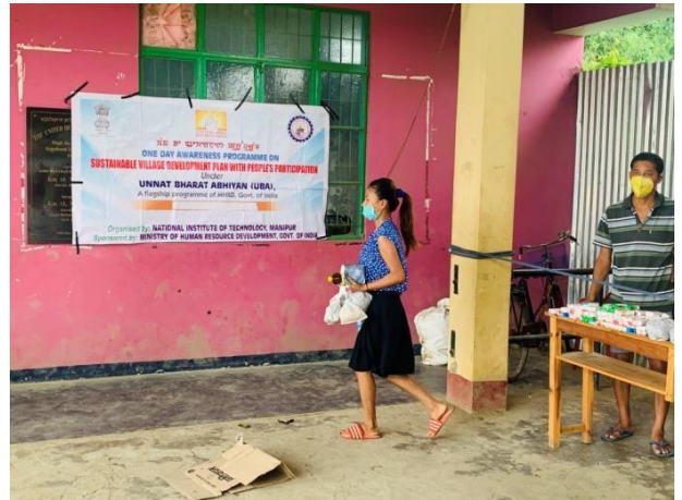
A Girl leaving the community hall after receiving essential commodities