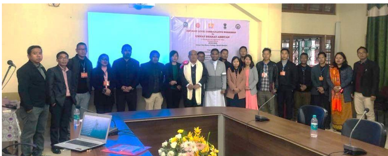
District Level Workshop under UBA for Senapati District at Don Bosco College, Maram on 26th February 2020

The workshop on “District Level Workshop under UBA for Senapati District” was organized on 26th February 2020 at Don Bosco College, Maram, Senapati. Considering the distance, such district level workshop was being organized at Don Bosco College, Maram. The workshop was attended by 20 faculties nominated by the invited colleges, organizing members from Don Bosco College including the UBA members of NIT Manipur. The workshop was performed in three sessions with the main objectives of the workshop. The methodology adopted was Invite colleges, Shared NIT Manipur’s accomplishment as PI under UBA, Registration of the colleges under Unnat Bharat Abhiyan and interaction. As an outcome of this workshop, the participated faculties from different colleges came to know about UBA, they were encouraged to register under UBA.