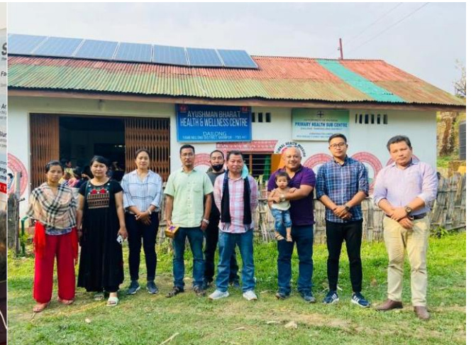
UBA NIT Manipur Team, Tamenglong College PI, and other volunteer in the Medical camp