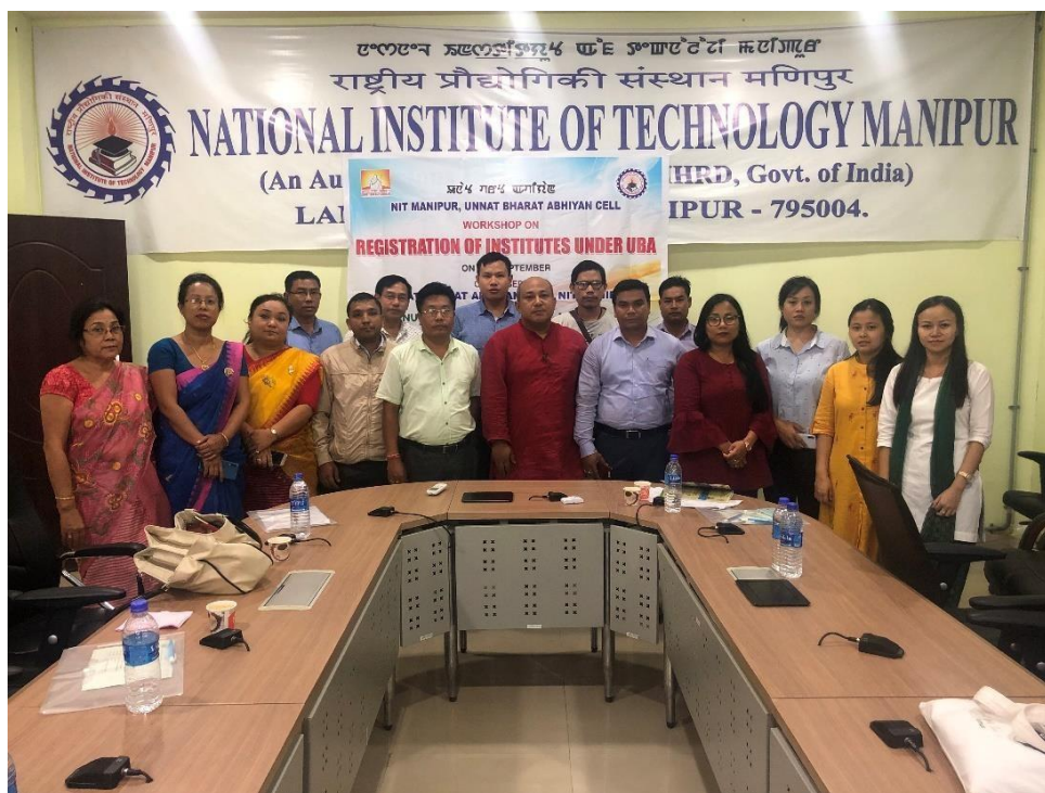
Registration of Participating institute under UBA at NIT conference Hall.

As an outcome of this workshop, many of the participants registered under UBA on the spot and thus shortlisted as PIs under UBA under RCI NIT Manipur and hence the main target or role as RC is fulfilled. Further, the Coordinators/Representatives of the PIs have better ideas and knowledge regarding UBA encouraging them to actively involve for leveraging their knowledge and their expertise to build an inclusive India by addressing specific issues in their UBA adopted villages.