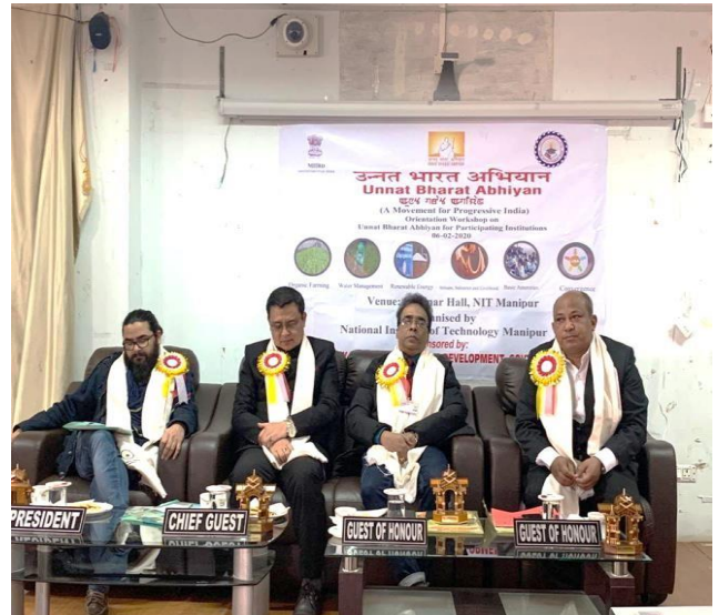
Delegates during the Orientation Programme.