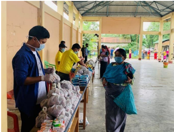
Club Volunteers Distributing essential commodities