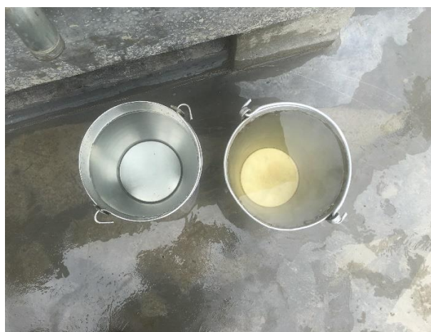
Image showing the difference between from the left to the right Treated water by the water treatment plant and untreated pond water.