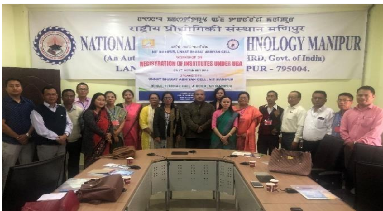
Registration for Participating Institute under Unnat Bharat Abhiyan for Imphal East District, at NIT Manipur.

As an outcome of this workshop, participants from Imphal East Colleges registered under UBA on the spot, thus increased in number of PIs in Manipur. The Registered PIs will further enhanced the vision of UBA in the villages, therefore bringing the developmental changes in the rural areas.