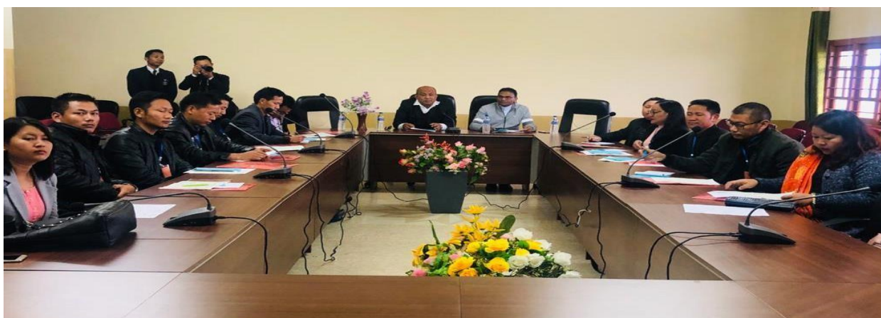
Invited Senapati colleges' faculties participating in the programme.