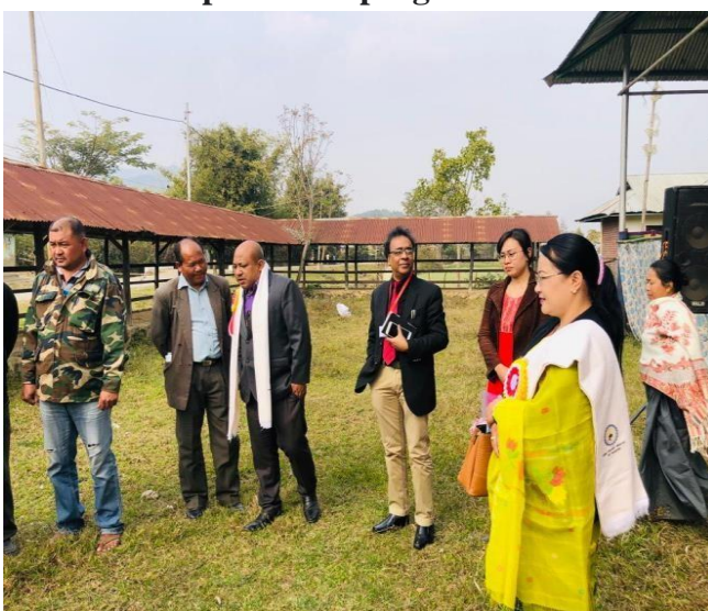
Site visit for construction of treatment plant in the village.