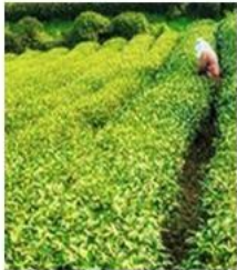
Sustainable Agriculture Systems