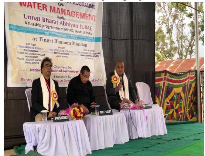
Delegates in the programme