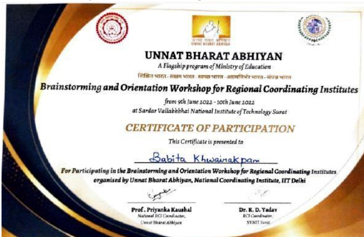
Babita Khwairakpam, UBA NIT Manipur Staff in the "Brainstorming and Orientation workshop" on 9th-10th June 2022 in SVNIT, Surat