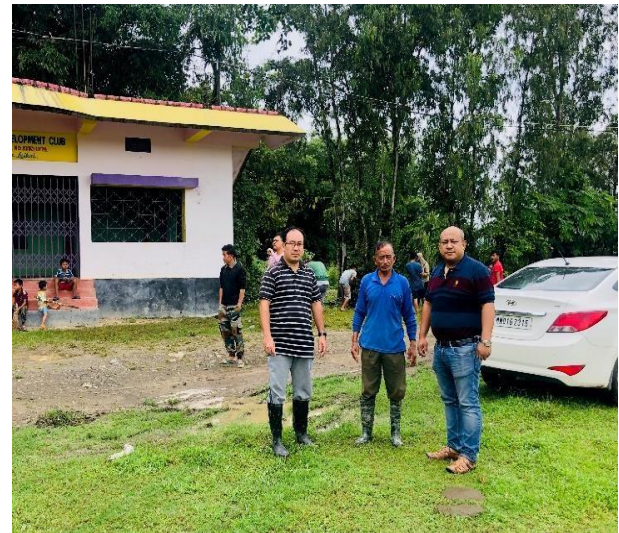
Swachhata Hi Seva campaign in the adopted villages