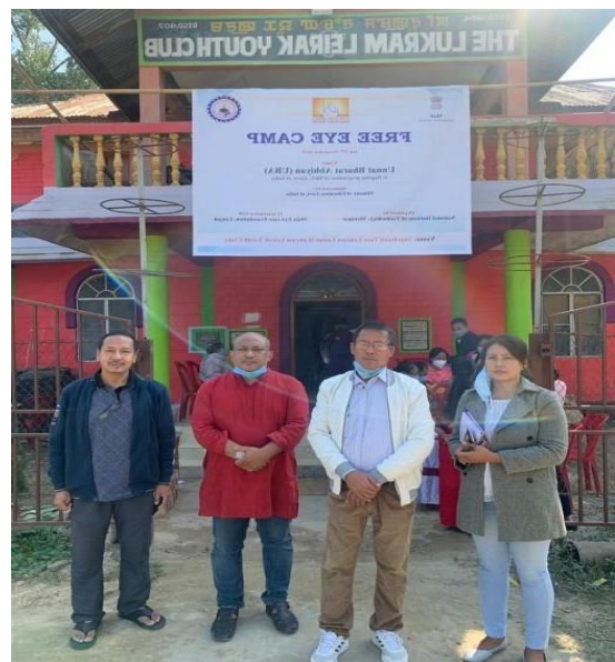
UBA NIT Team, Volunteers (LLYC) and Shija Eye Care Foundation Team in the Free Eye Camp at Sagolband Tera Lukram Leirak, 27 th November 2021