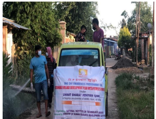
Sanitising Vehicle With volunteers