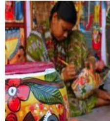
Artisans, Industries and Livelihoods