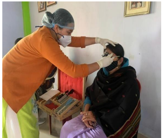
Vision testing by the optometrist during the camp