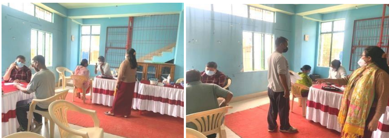
Villagers coming out for free eye checkup during the Eye Camp at Sadokpam

National Institute of Technology Manipur in collaboration with Shija Eye Care Foundation, Langol and United Development Club, Sagolband, Imphal, organized a free medical eye check-up camp for the residents of Sadokpam Leikai on 31 st March 2022 from 9.30 am till 3.30 pm. The team of Shija Hospital with the volunteers of the club and NIT team very passionately contributed their best support to the camp. The program was conducted under the scheme of Unnat Bharat Abhiyan (UBA), Ministry of Education, Government of India. Altogether, 130 residents of all ages attend the free eye check-up.