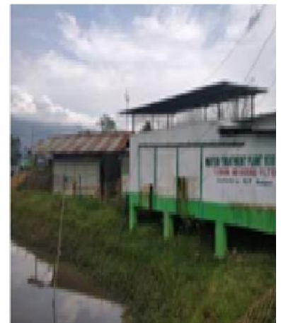
2nd Water Treatment plant constructed in Maibam Chingmang, April 2018