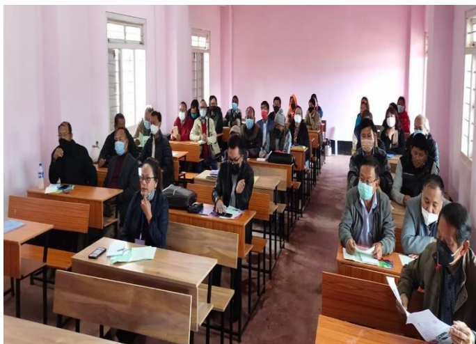
Invited faculties participating in the programme