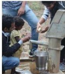
Water Resource Management