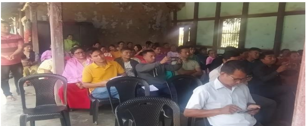
Youth Against Drugs Kakching Khunou, Awang Ningthou Leikai on 26 th Feb 2023