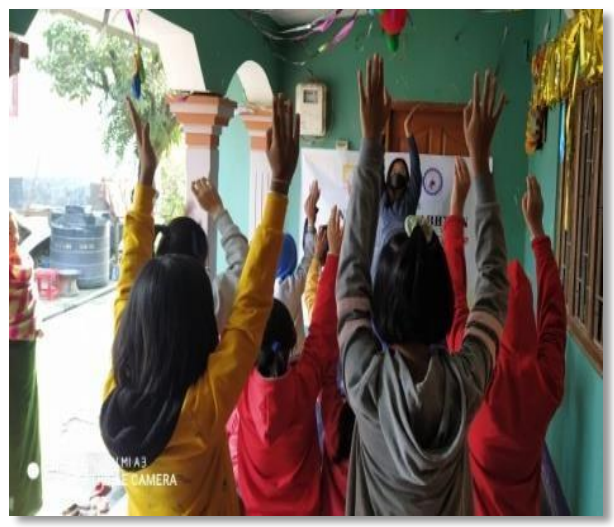
Covid awareness programme for the village children conducted on 15th January 2022 at Lukram Leirak Ward no.1 and on 18th January 2022 at Kongkham Awang Leikai