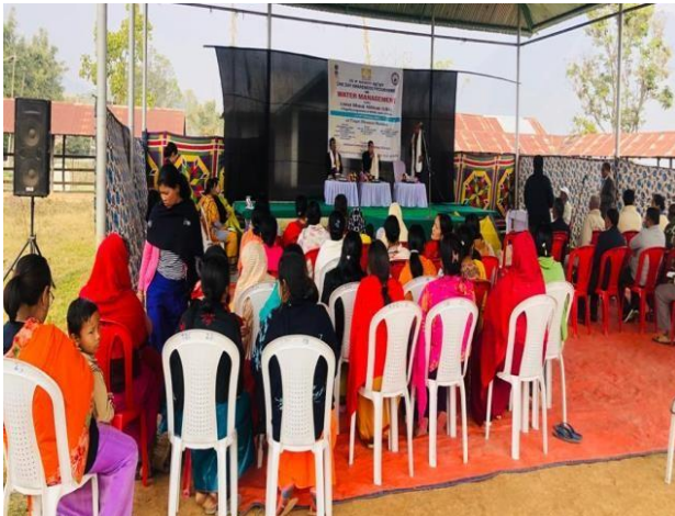
Villagers participating in the programme