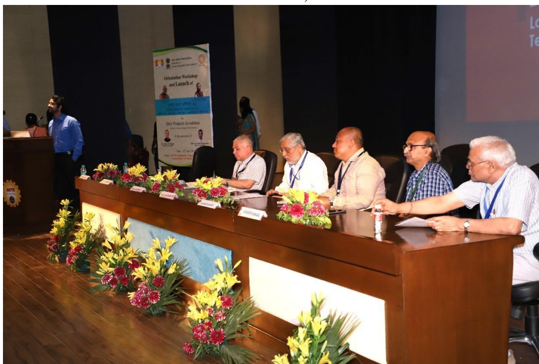
Delegates invitees during the Launching New Framework for UBA at AICTE, Auditorium on 25 th April 2018