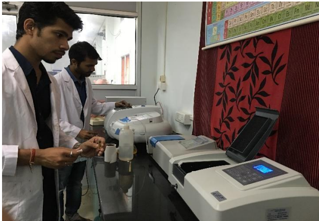
Water parameters analysis in NIT Lab for the treated water from the Treatment water plant