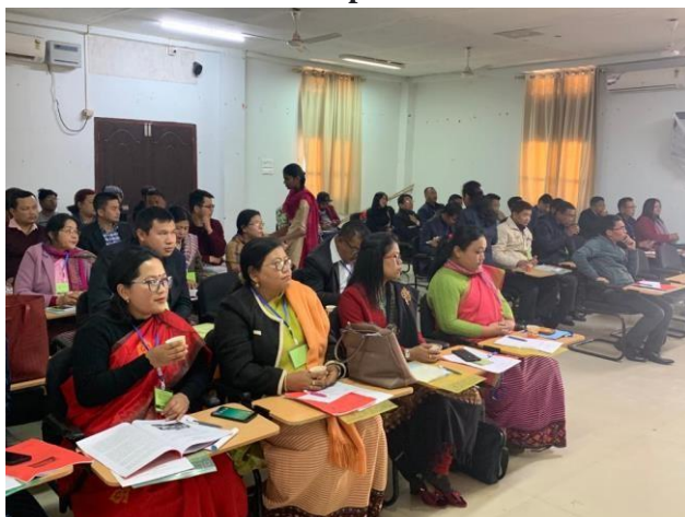
Participating Institutes Coordinator in the programme.