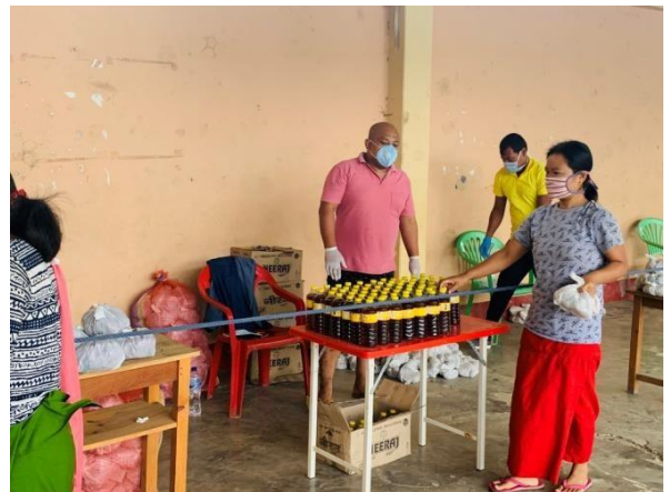
A villager picking up the Oil