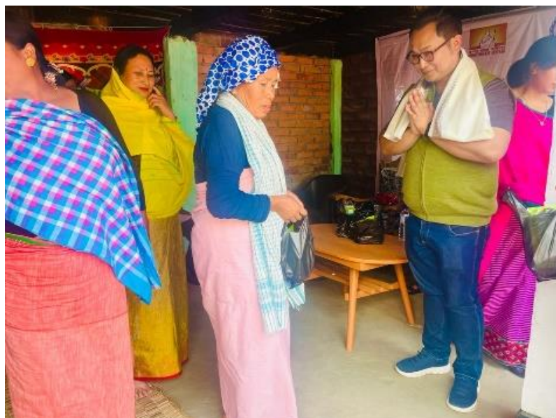
Dignitaries distributing necessary items to the villagers during the Agricultural Relief Initiative programme at Pangaltabi Mayai Leikai on 25th Feb 2023