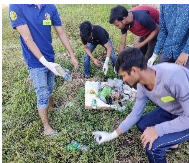
Plastic free campaign in the adopted villages along with UBA NIT Students Club