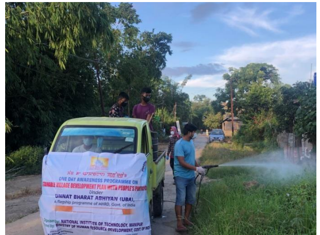
Spraying grass killing chemicals