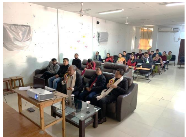
Interaction during the Programme