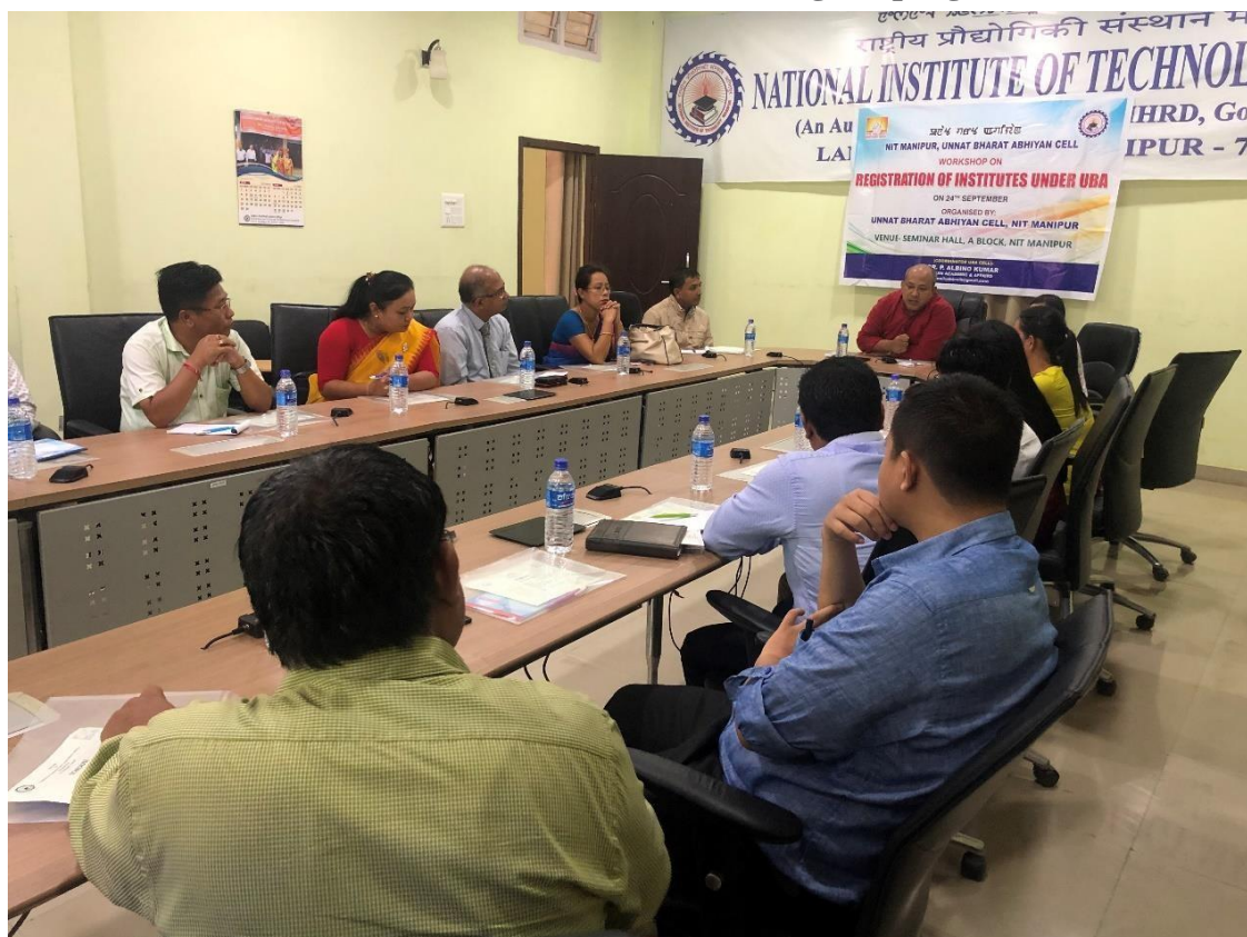
Queries interaction during the programme