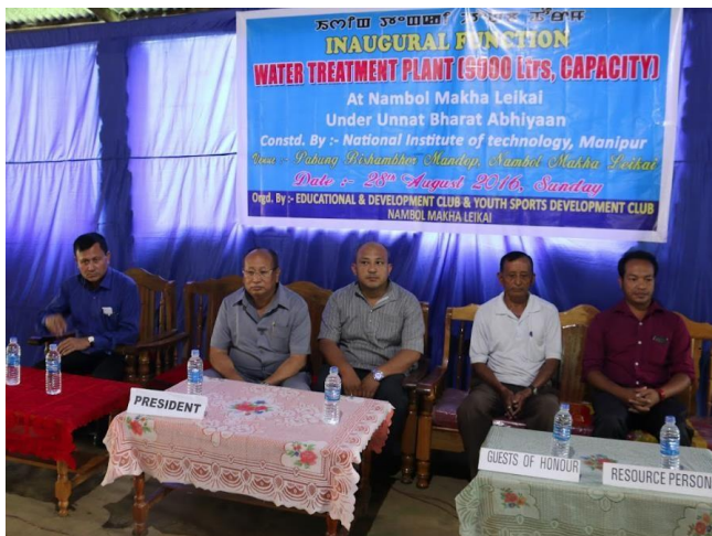
Special Invitees in the Inaugural function of the Water Treatment Plant at Nambol.