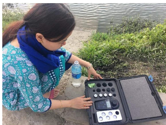
Analysis of the physical parameters of the pond water in the village