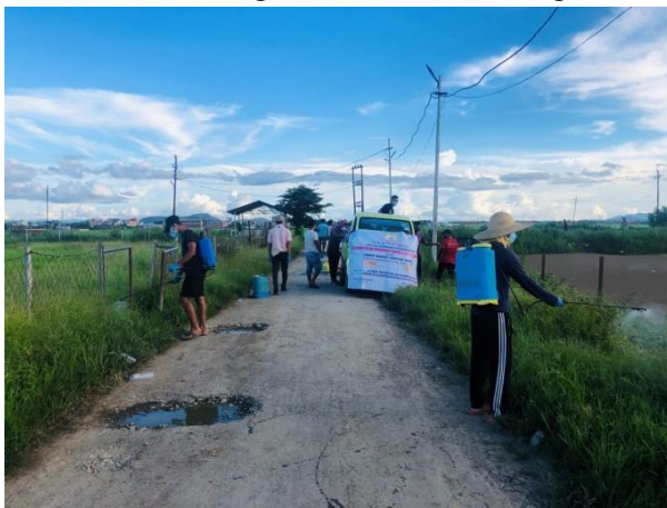
Villagers sanitising the Pond periphery which is the likelihood of the village