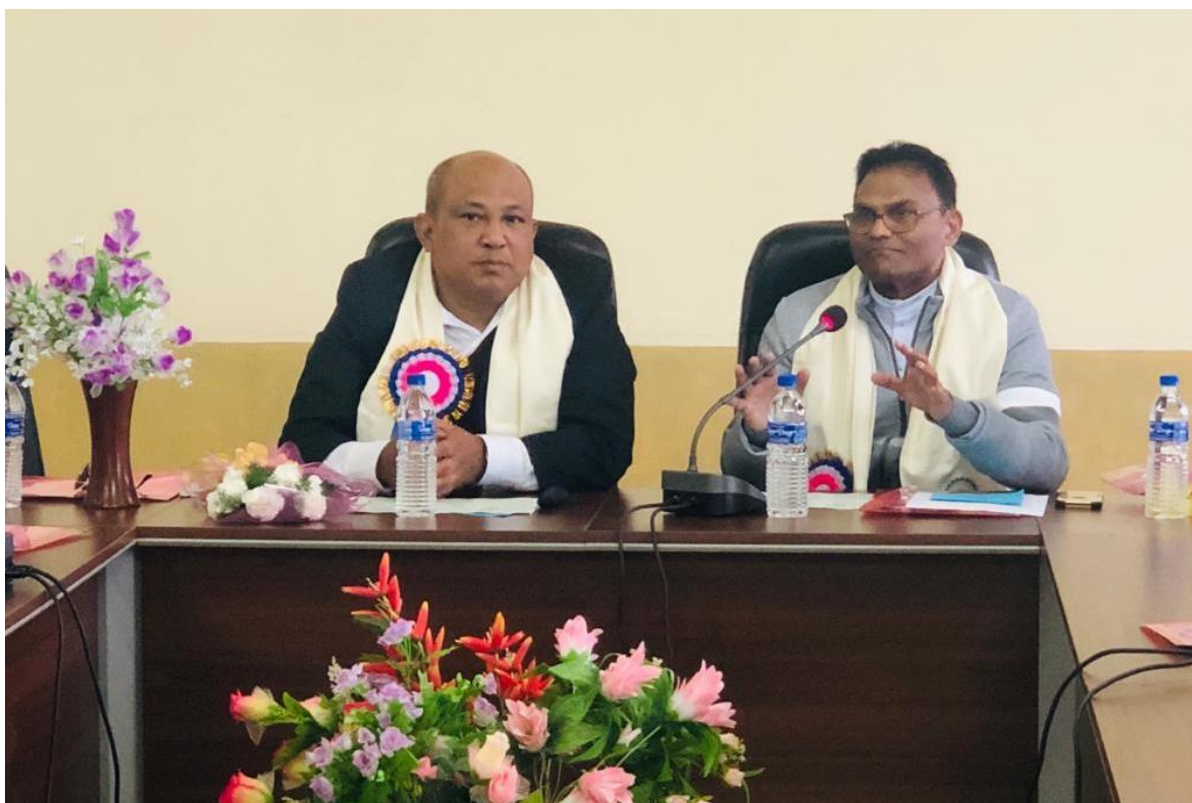
UBA Coordinator and Father of Don Bosco, College , Maram in the programme