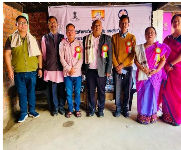
Dignitaries and Villagers in the Agricultural Relief Initiative programme at Pangaltabi Mayai Leikai on 25th Feb 2023