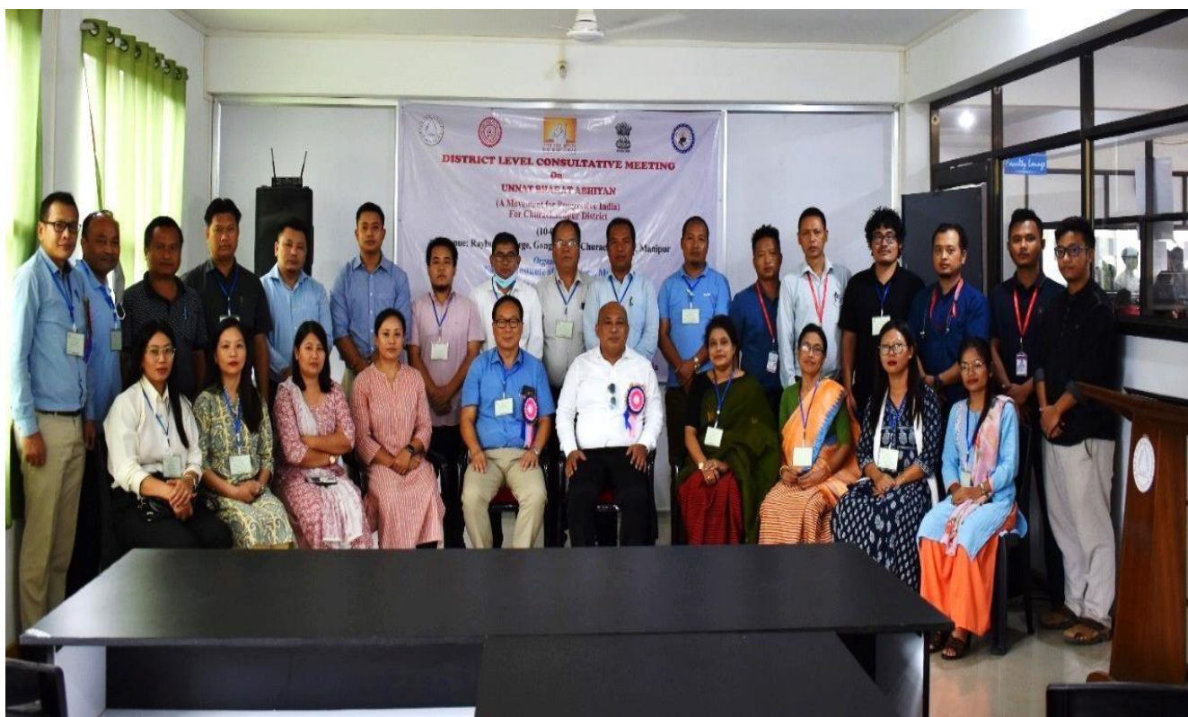
“District Level Workshop under UBA for Churachandpur District” on 10th August 2022 at Rayburn College, Churachandpur organised by NIT Manipur.