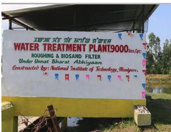
Constructed 9000 L Low Cost Water treatment Plant at Nambol (adopted village)

NIT Manipur under Unnat Bharat Abhiyan adopted 5 (five) villages at Nambol, Bishnupur District of Manipur namely- Nambol Makha, Kongkham Awang, Maibam Chingmang, Nambol Bazar & Koriphaba. A low cost 9000 L water treatment plant based on roughing and biosand filter was constructed at Nambol by NIT under UBA on 27th August 2016. The treatment plant serves the villagers within 3 km radius. Another 2nd water treatment plant was constructed and handed over to villagers of Maibam Chingmang in April 2018.