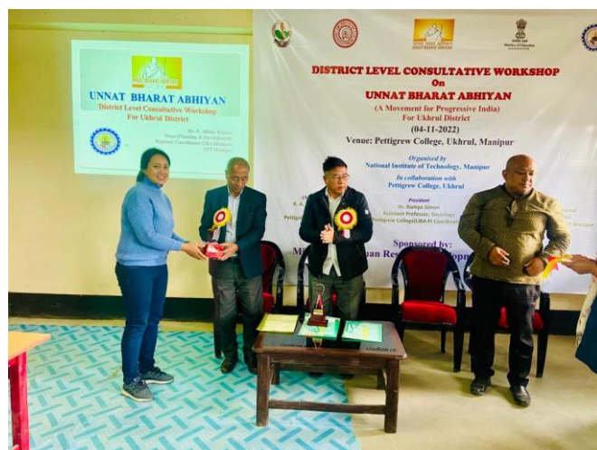
District Level Workshop under UBA for Ukhrul District at Pettigrew College, Ukhrul.