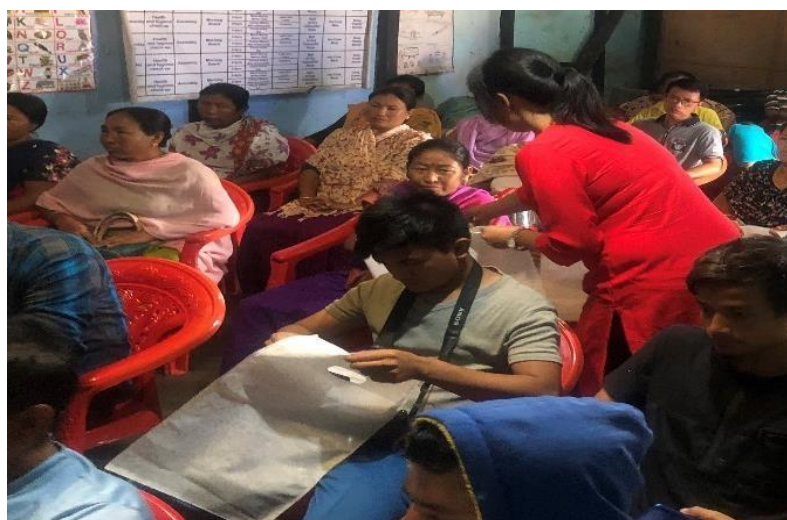
Distribution of Cloth bags.