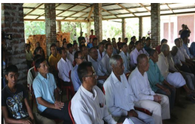
Villagers attending the programme