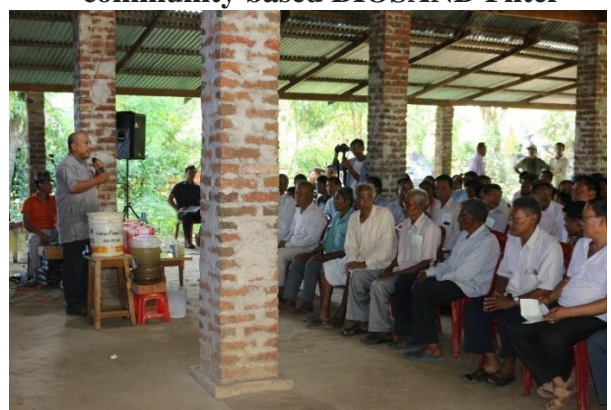
UBA Coordinator, NIT Manipur elaborating the hygienic & healthy lifestyle in the programme.