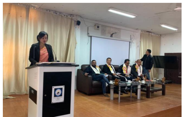
Technical session by UBA NIT Manipur in the programme.