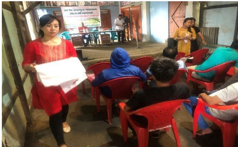
Distribution of Cloth bags