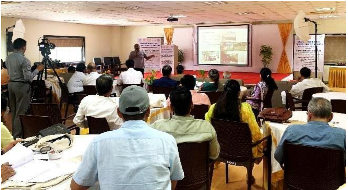
RCI NIT Manipur participating and sharing their experience in the "Brainstorming and Orientation workshop" on 9th-10th June 2022 in SVNIT, Surat