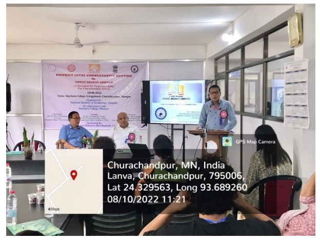
Glimpse of the programme at Rayburn College, Churachandpur.