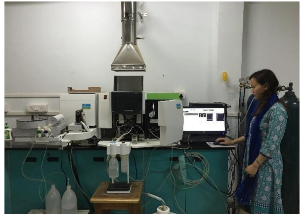
Laboratory analysis of the treated water, checking for its portability for drinking.