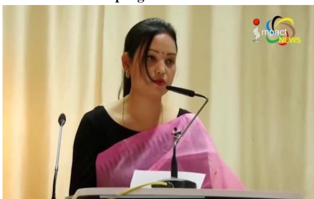
Facilitation for invited participants by UBA NIT Manipur Team.