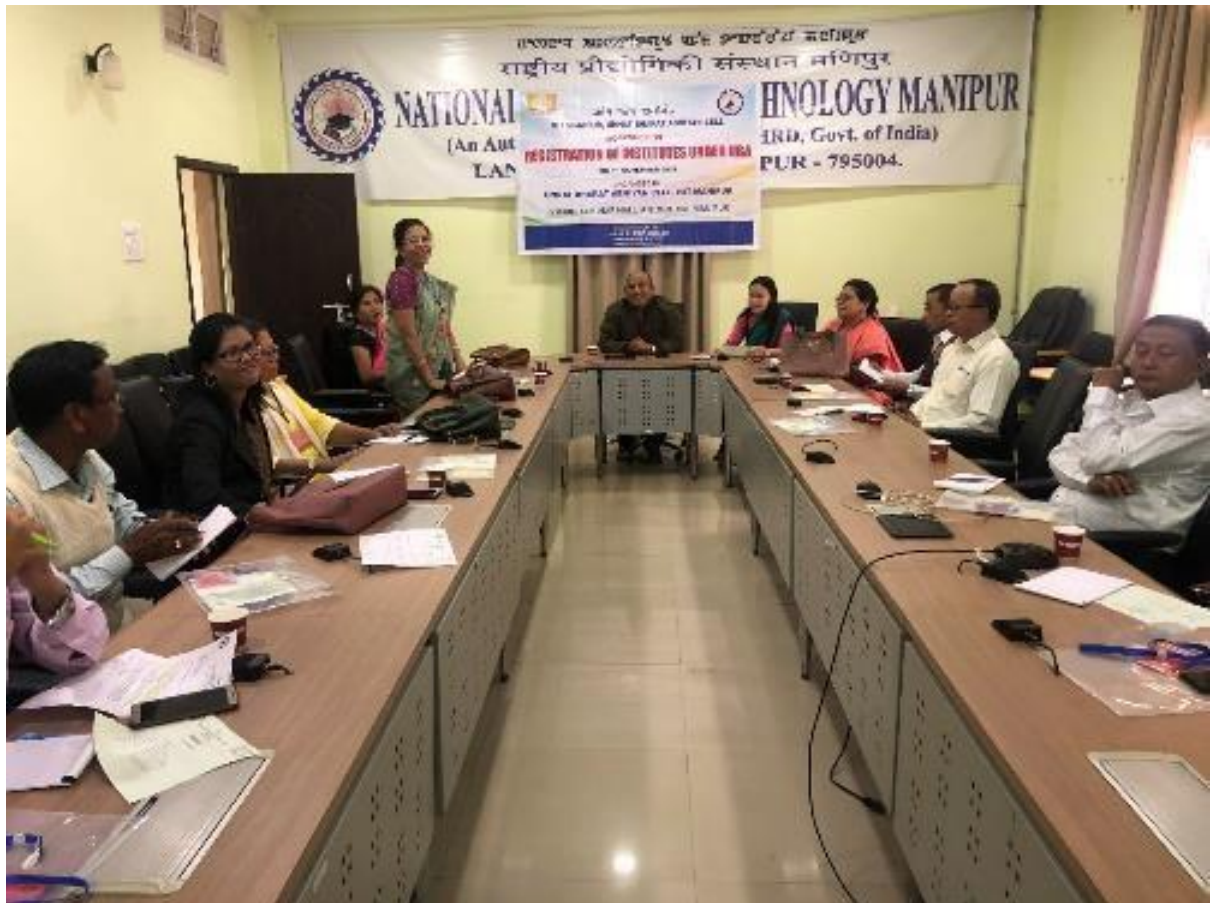
Interaction with the invited faculties during the programme.