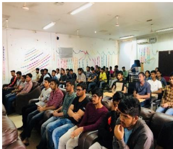
Presentation conducted by the students related with plastic related crisis