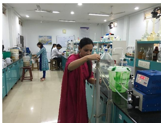
Chemical parameters analysis of the pond water in the NIT Lab.