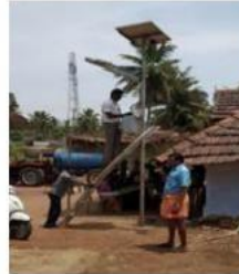
Rural Energy Systems