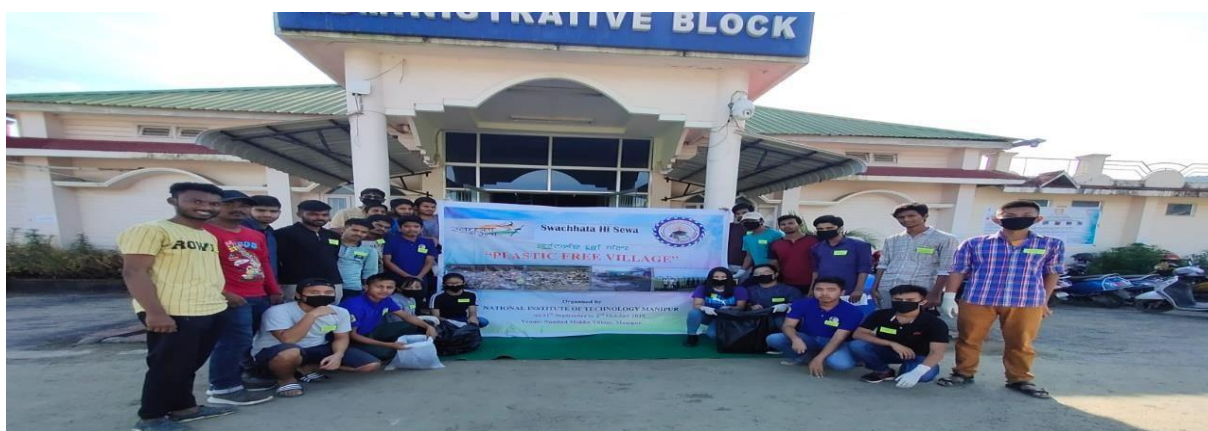
Swachhata Hi Seva at NIT Campus.