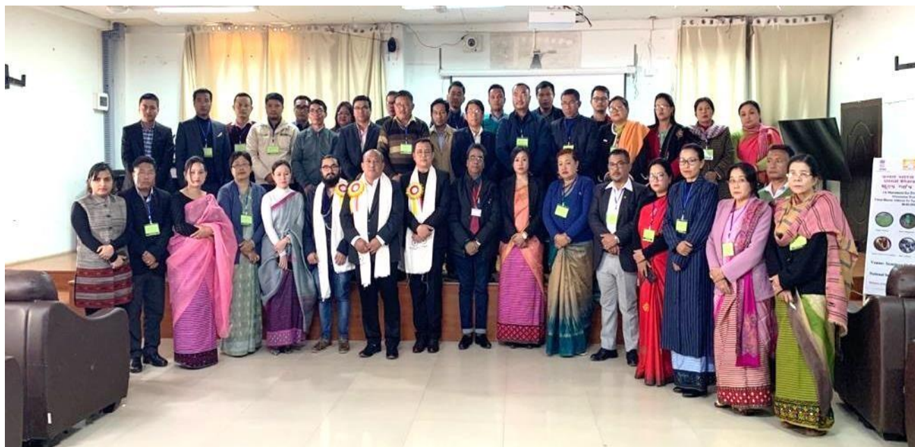
Orientation programme at NIT Manipur on 6th February 2020.

This programme has enriched the Participating Institute Coordinators and other Institute representatives to effectively participate in the holistic development in their adopted villages using eco-friendly sustainable technologies and local resource creating sufficient employment opportunities in the process, harnessing multifarious government schemes, customized use of existing technologies and use of knowledge as per the local needs, to improve the livelihood of the rural masses. The workshop has elevated the enthusiasm of the coordinators and other participants in the workshop to actively involve themselves and their expertise to execute the UBA mission in their adopted villages