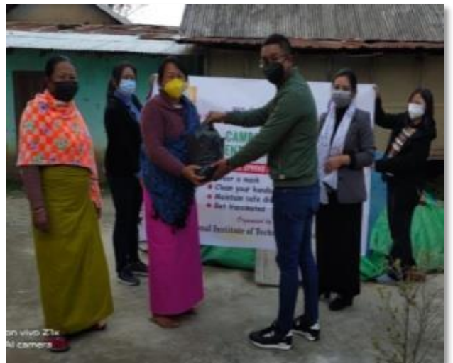
Covid Awareness campaign and distribution of essentials items in the adopted villages under Perennial Assistance by NIT UBA staff.