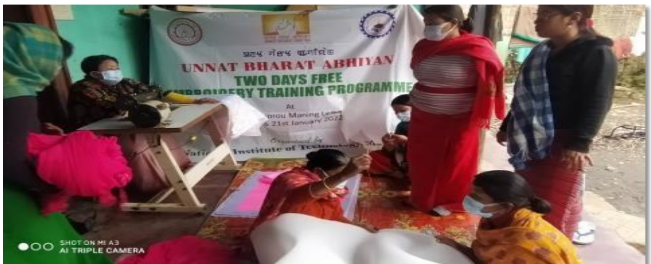
Two Days Embroidery Training Programme conducted on 20th & 21st January 2022 at Sangaiprou Maning Leikai