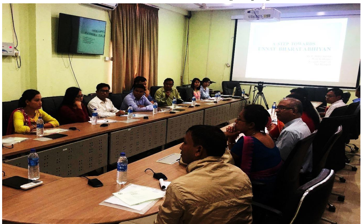
Queries interaction during the programme