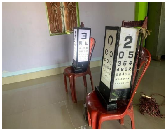
Eye check up by the ophthalmologist during the camp

Glimpse of the Eye Camp held on 27Th November 2022 by UBA NIT Manipur at Sagolband Tera Lukram Leirak