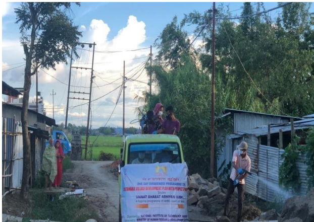
Sanitizing vehicle with UBA NIT Manipur banner through the streets of village