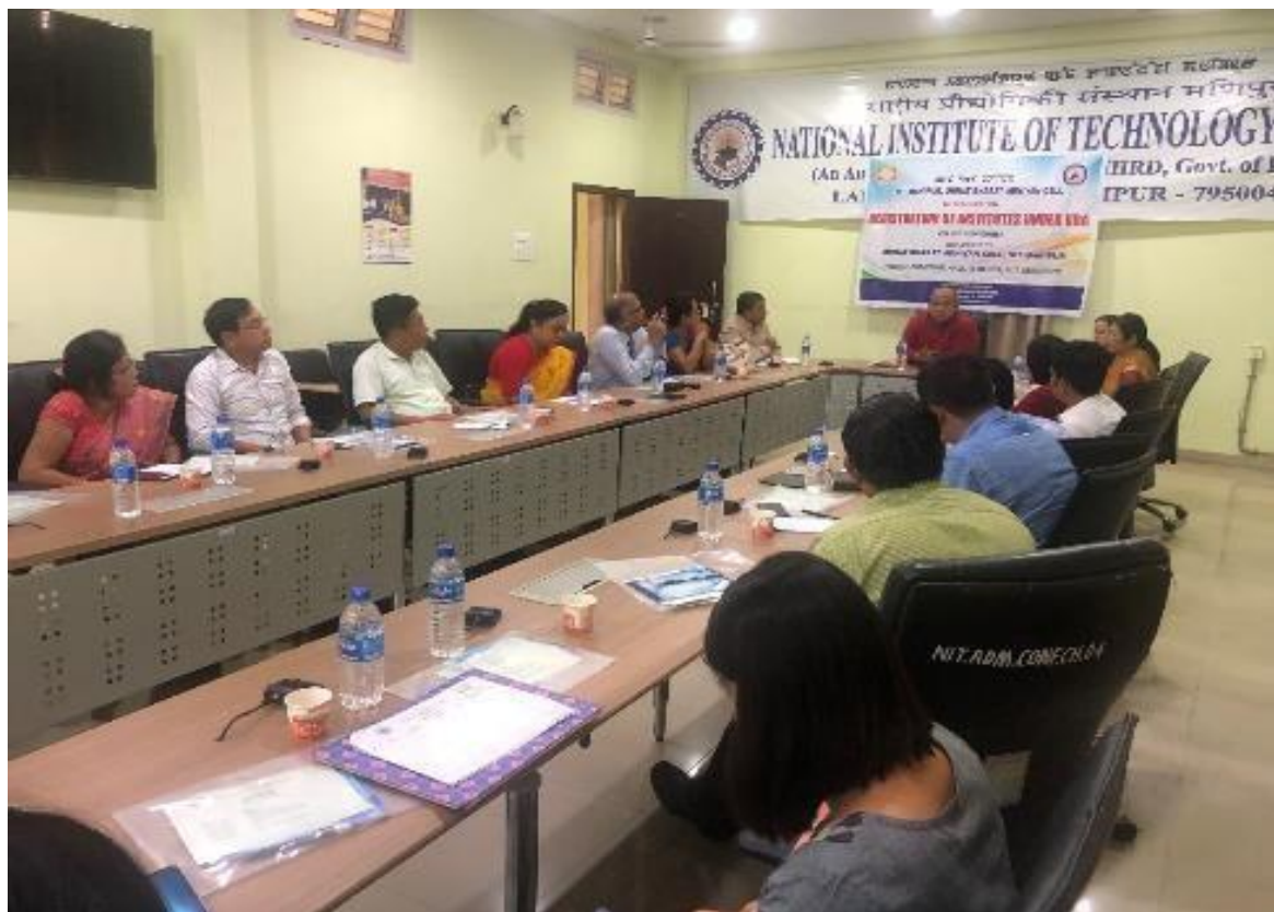
Interaction with the invited faculties during the programme.