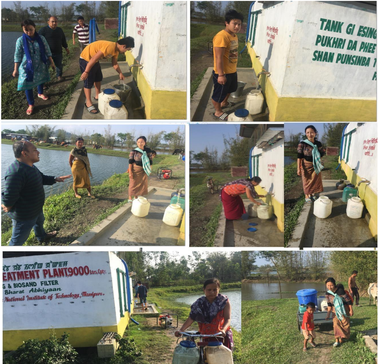
Villagers depending on water treatment plant constructed by NIT Manipur