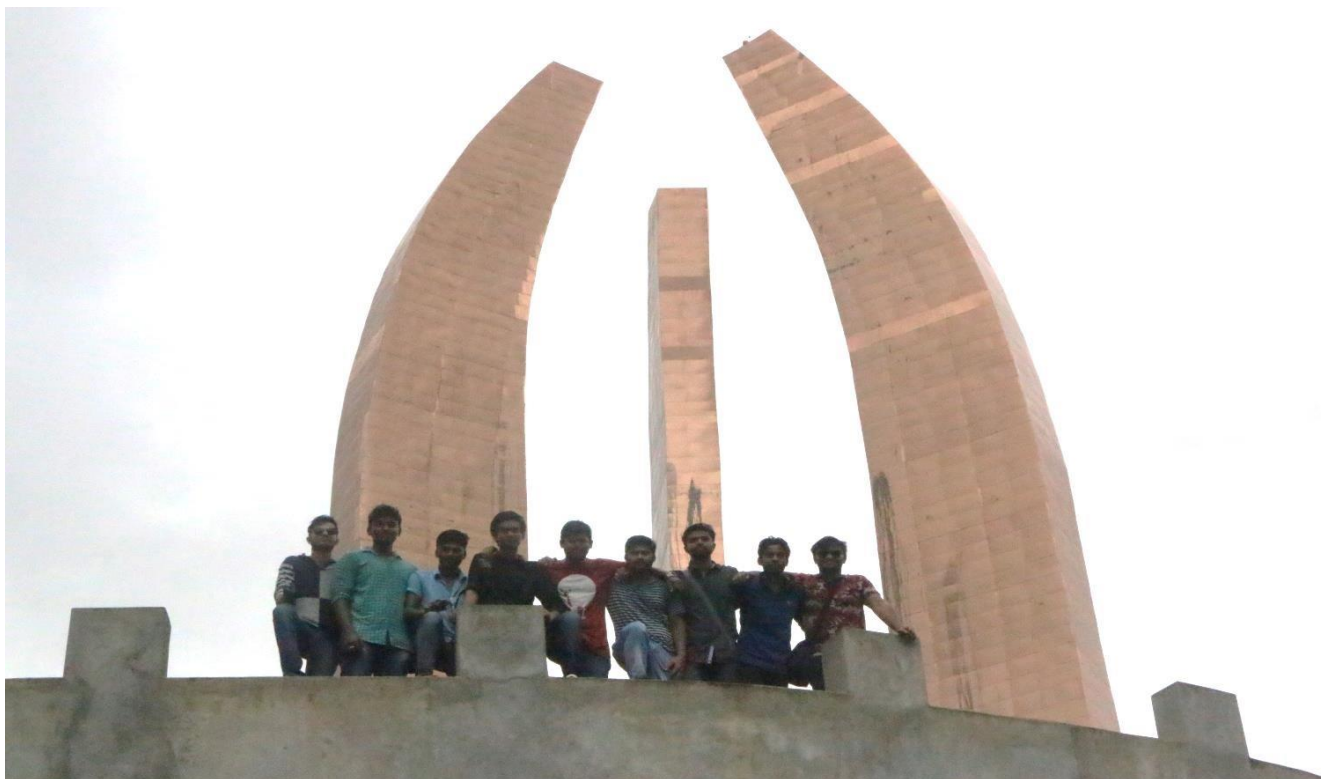
UBA NIT students