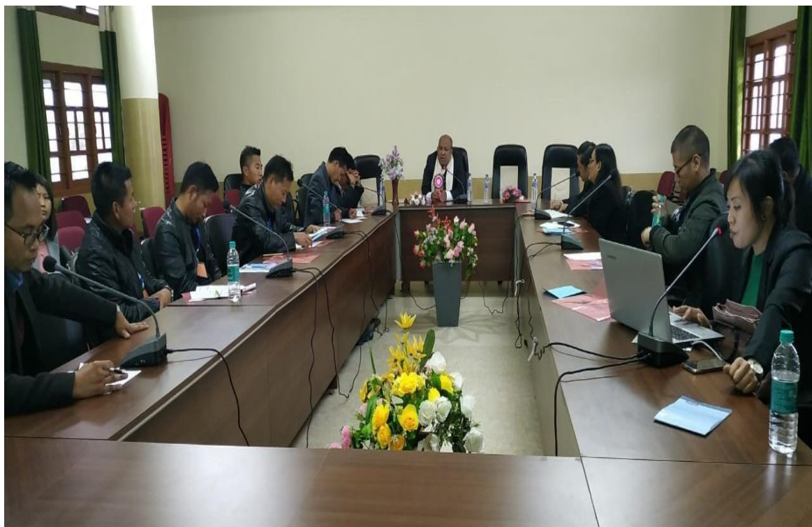
Queries and formal interaction with invited faculties and UBA NIT Team in the programme.