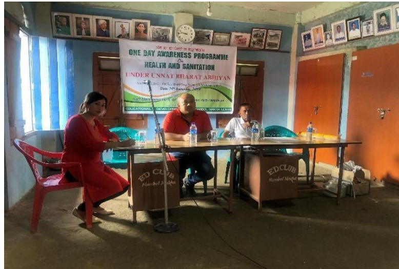
Discussion with villagers during the programme.