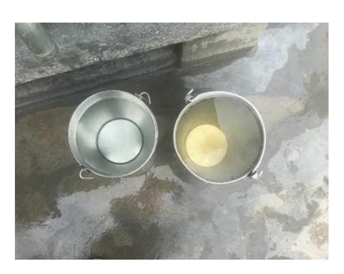
Image showing the difference between from the left to the right Treated water by the water treatment plant and untreated pond water.