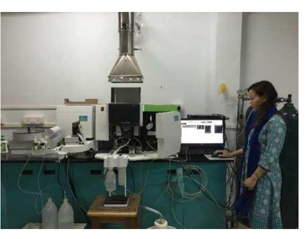
Laboratory analysis of the treated water, checking for its portability for drinking.