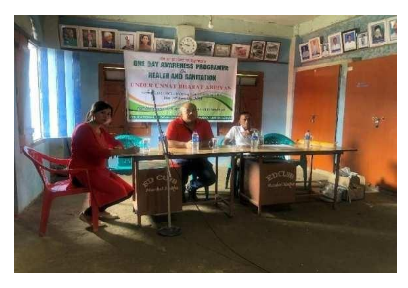
Discussion with villagers during the programme.