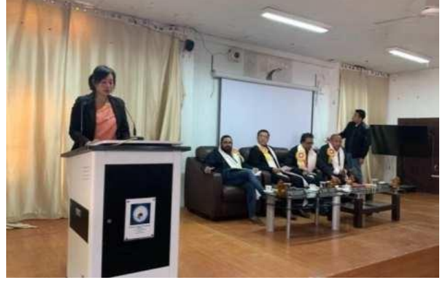
Technical session by UBA NIT Manipur in the programme.