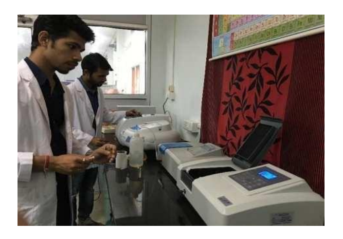
Water parameters analysis in NIT Lab for the treated water from the Treatment water plant