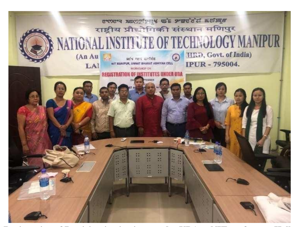
Registration of Participating institute under UBA at NIT conference Hall.

As an outcome of this workshop, many of the participants registered under UBA on the spot and thus shortlisted as PIs under UBA under RCI NIT Manipur and hence the main target or role as RC is fulfilled. Further, the Coordinators/Representatives of the PIs have better ideas and knowledge regarding UBA encouraging them to actively involve for leveraging their knowledge and their expertise to build an inclusive India by addressing specific issues in their UBA adopted villages.