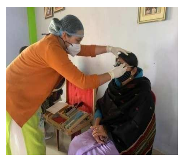
Vision testing by the optometrist during the camp