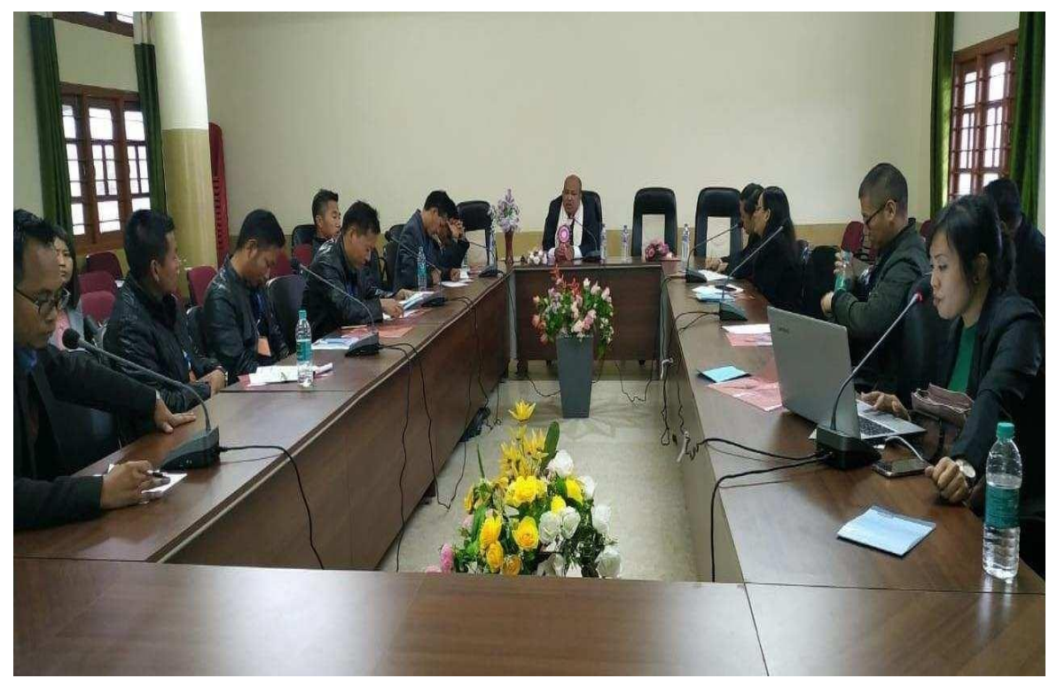
Queries and formal interaction with invited faculities and UBA NIT Team in the programme.