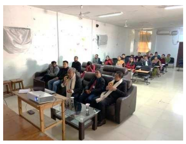
Interaction during the Programme