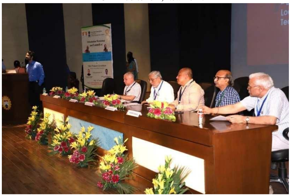
Delegates invitees during the Launching New Framework for UBA at AICTE, Auditorium on 25^{th} April 2018