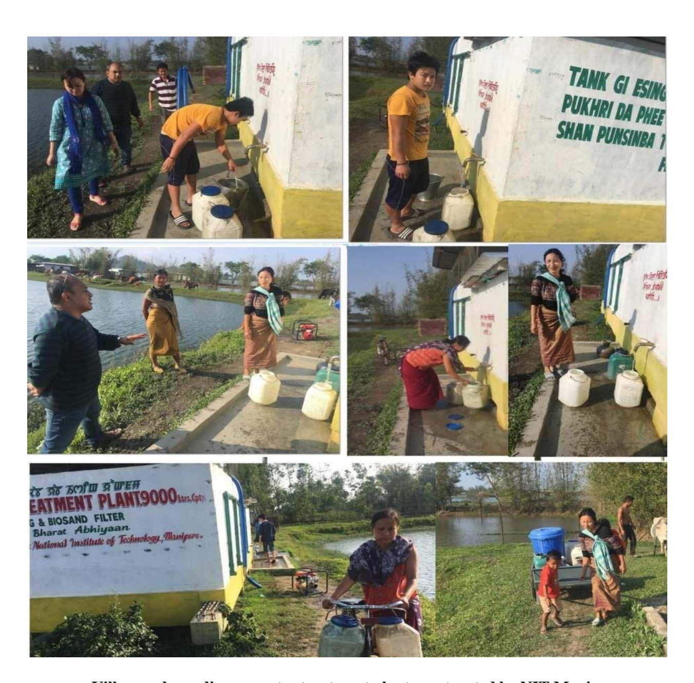
Villagers depending on water treatment plant constructed by NIT Manipur