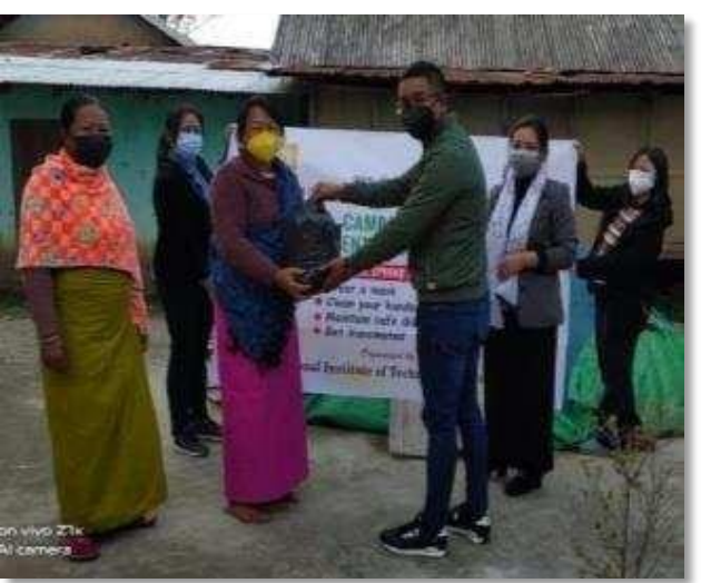
Covid Awareness campaign and distribution of essentials items in the adopted villages under Perennial Assistance by NIT UBA staff.