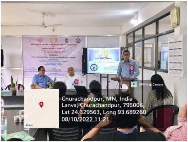
Glimpse of the programme at Rayburn College, Churachandpur.