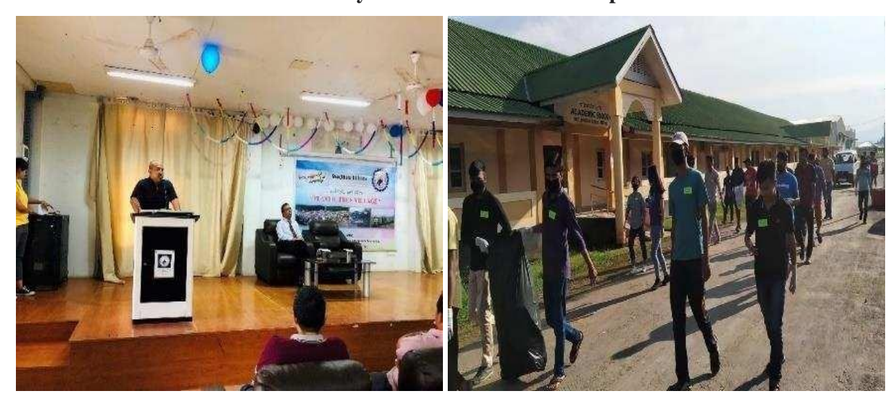
Sharmdan and declaration of plastic free campus at NIT Manipur