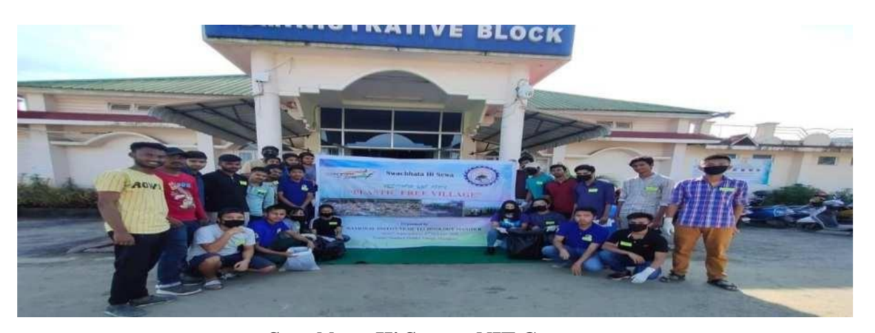
Swachhata Hi Seva at NIT Campus.