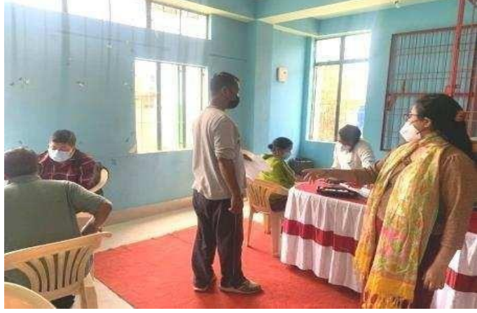
Villagers coming out for free eye checkup during the Eye Camp at Sadokpam