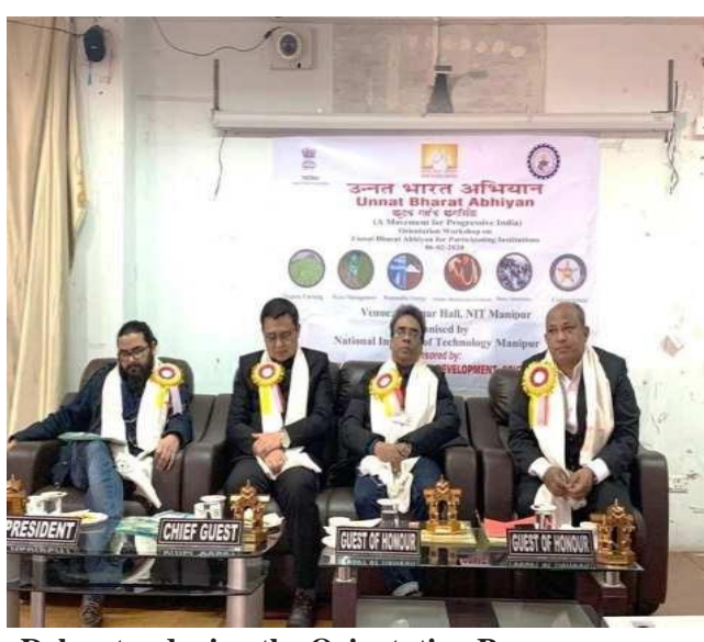
Delegates during the Orientation Programme.