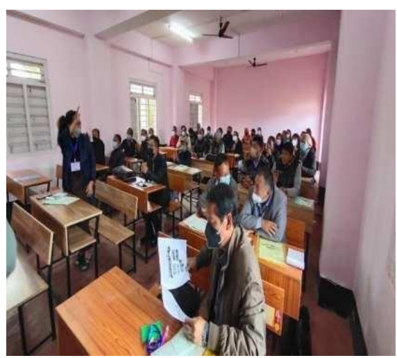
Invited faculties participating in the programme