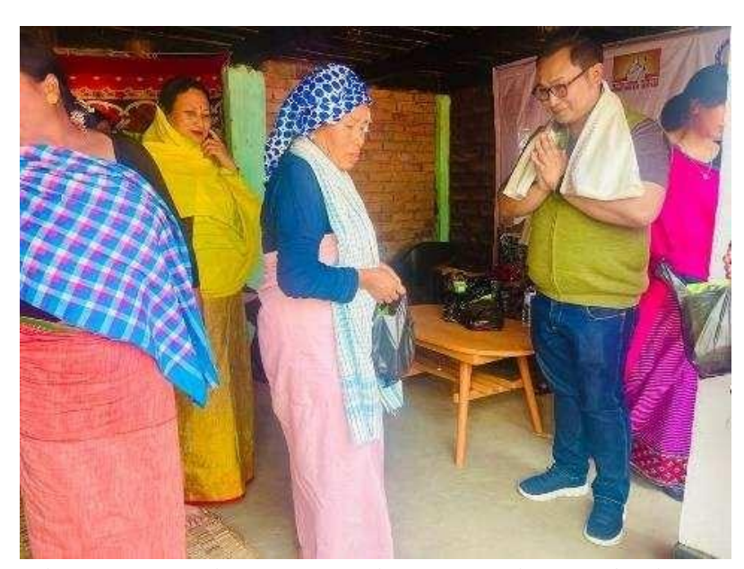
Dignitaries distributing necessary items to the villagers during the Agricultural Relief Initiative programme at Pangaltabi Mayai Leikai on 25th Feb 2023