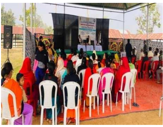
Villagers participating in the programme