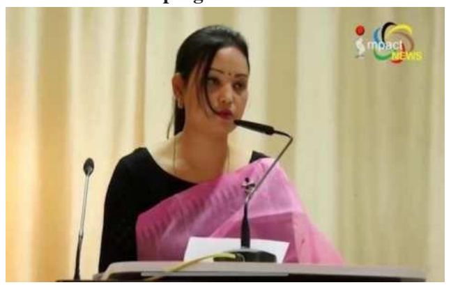
Facilitation for invited participants by UBA NIT Manipur Team.