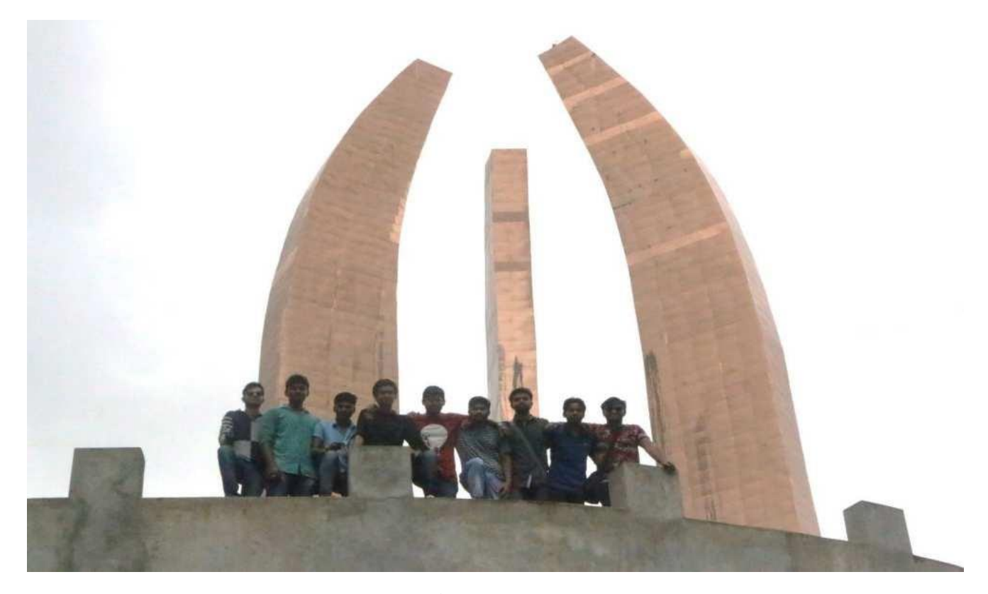
UBA NIT students