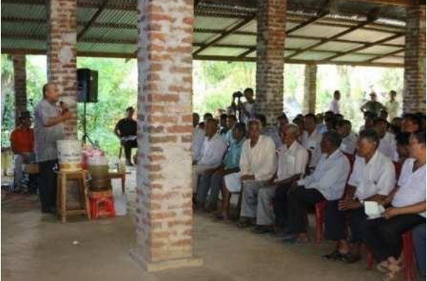
UBA Coordinator, NIT Manipur elaborating hygienic & healthy lifestyle in the programme.