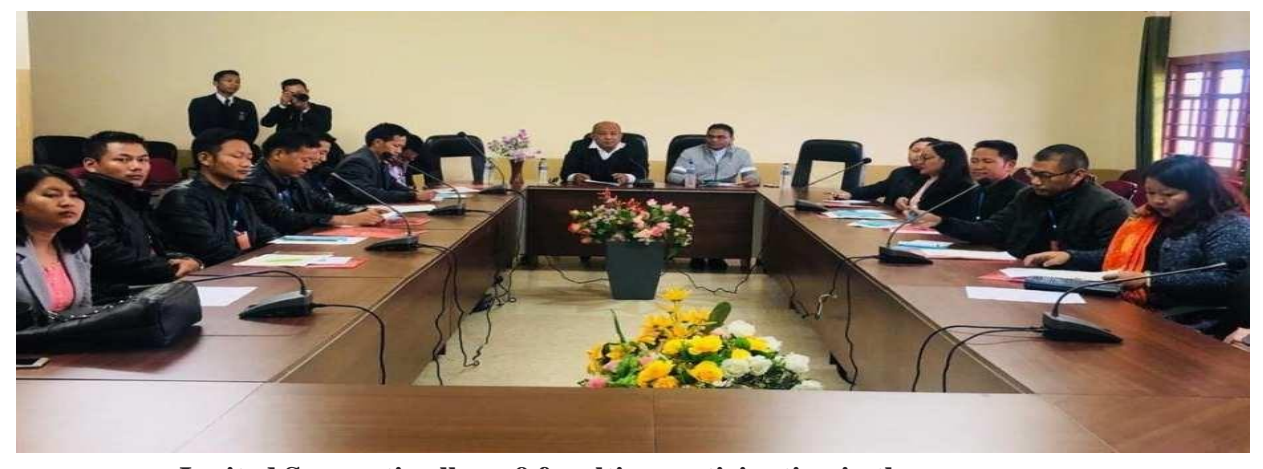
Invited Senapati colleges9 faculties participating in the programme.