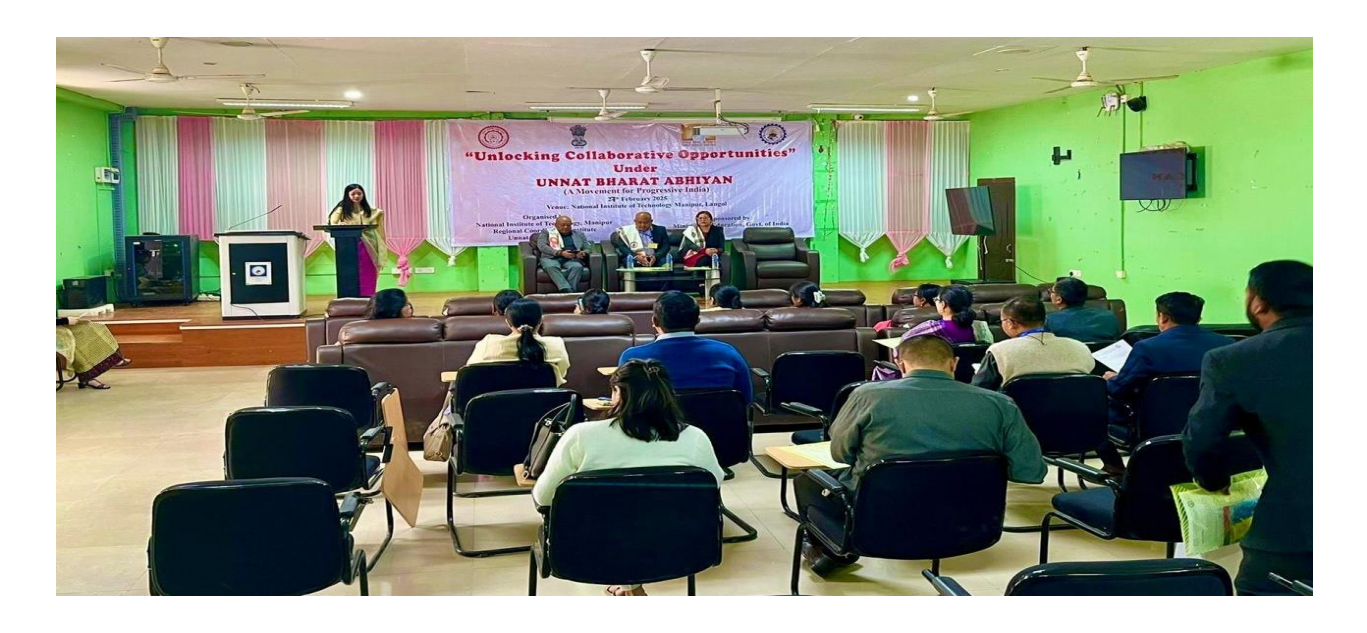
Participants attending the Unlocking Collaborative Opportunities program on 27th Feb 2025

The "Unlocking Collaborative Opportunities" program was organized under Unnat Bharat Abhiyan (UBA) at NIT Manipur on 27<sup>th</sup> February 2025. The program aimed to foster collaboration and knowledge sharing among stakeholders from academia, government, and local communities to promote sustainable rural development.