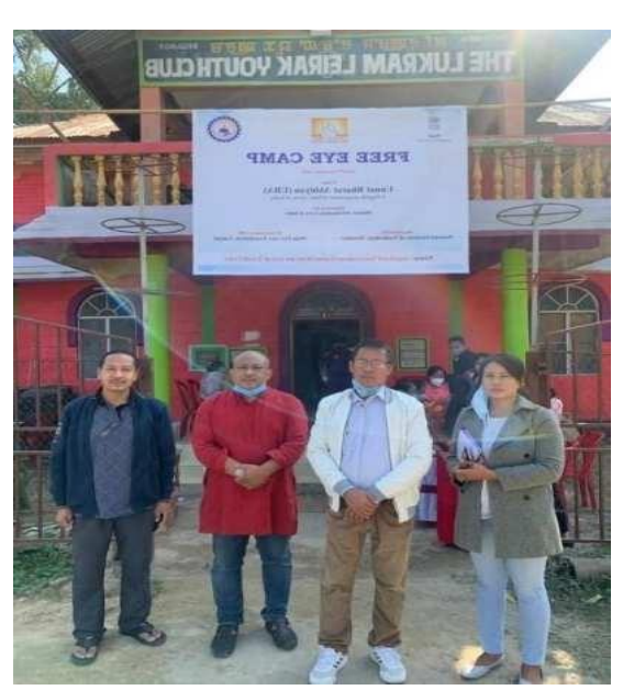
UBA NIT Team, Volunteers (LLYC) and Shija Eye Care Foundation Team in the Free Eye Camp at Sagolband Tera Lukram Leirak, 27<sup>th</sup> November 2021