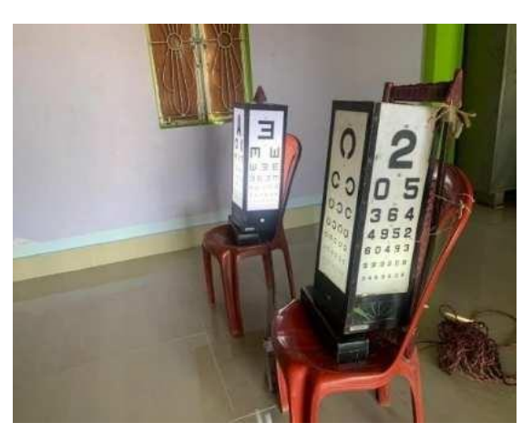
Eye check up by the ophthalmologist during the camp