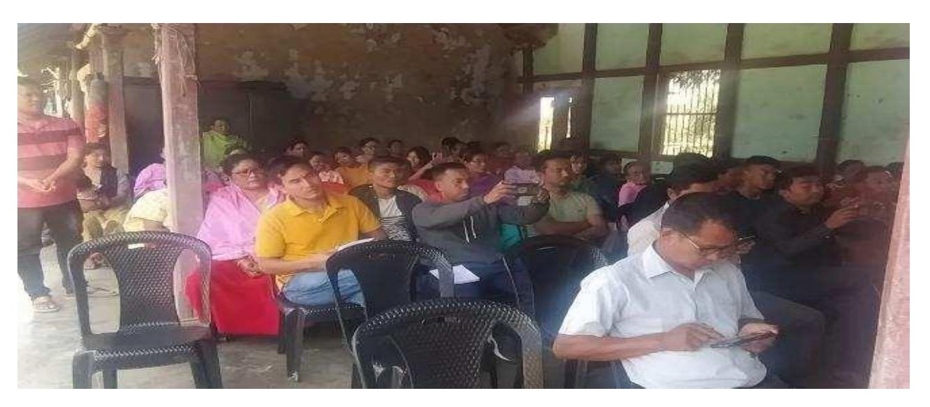
Youth Against Drugs Kakching Khunou, Awang Ningthou Leikai on 26th Feb 2023