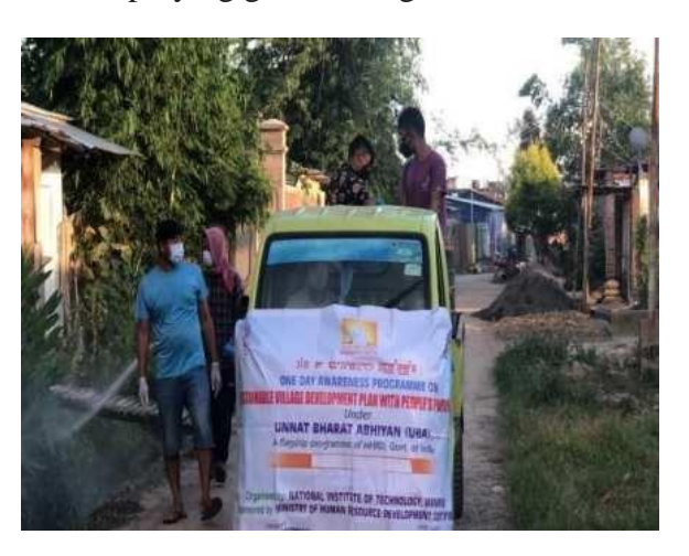
Sanitising Vehicle With volunteers