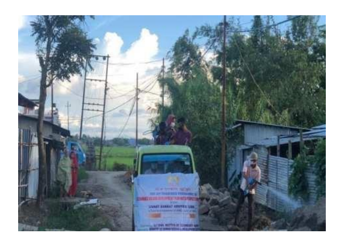
Sanitizing vehicle with UBA NIT Manipur banner through the streets of village