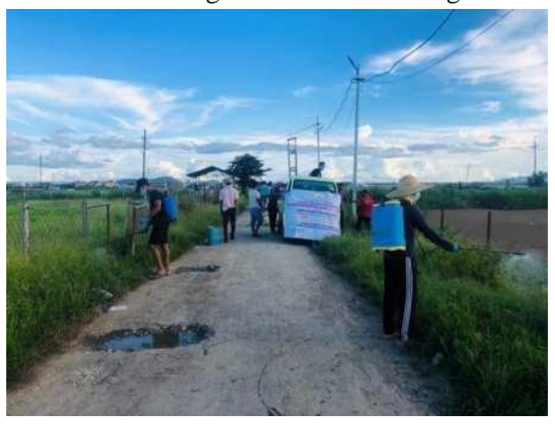
Villagers sanitising the Pond periphery which is the likelihood of the village