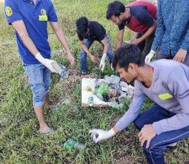
Plastic free campaign in the adopted villages along with UBA NIT Students Club