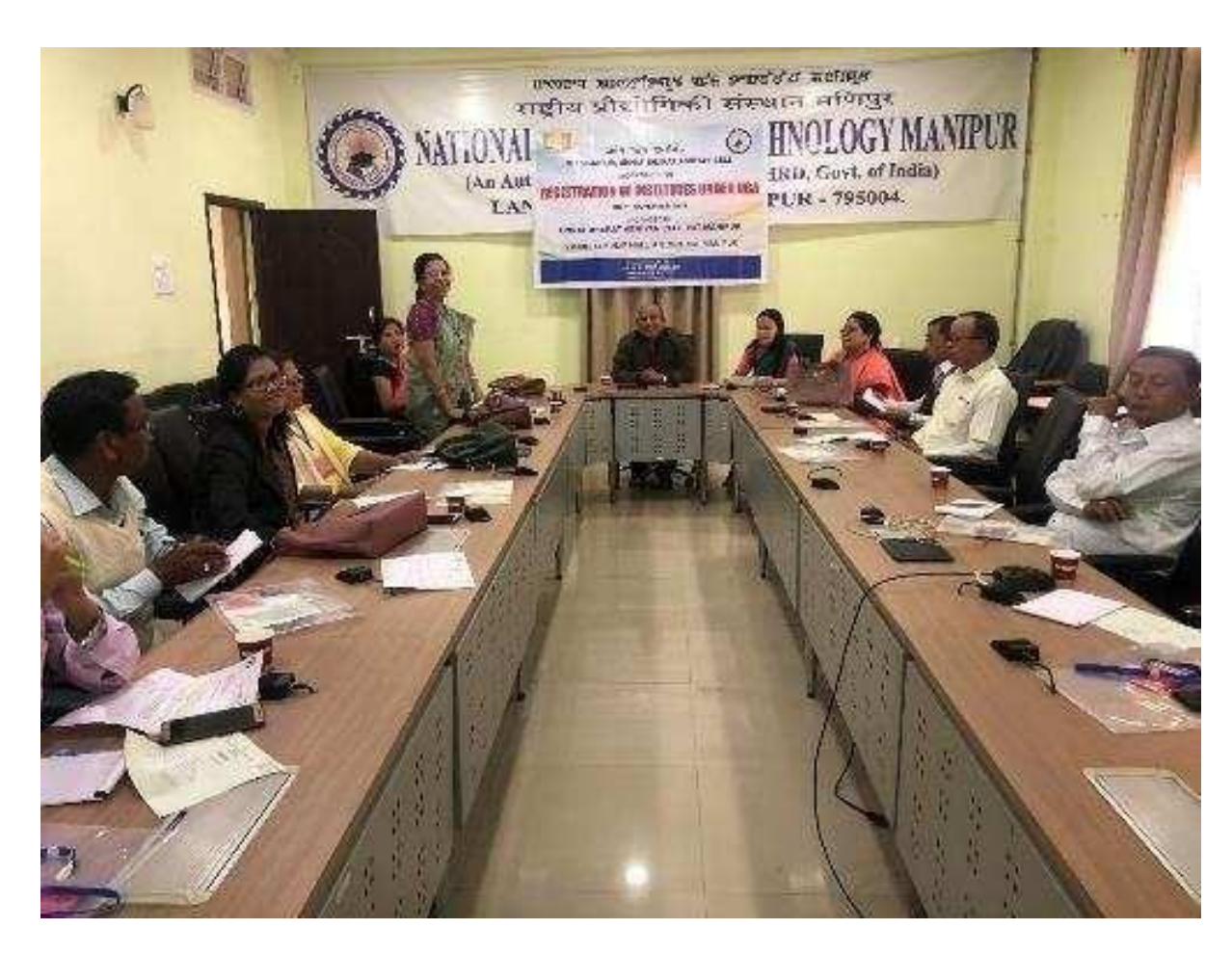
Interaction with the invited faculties during the programme.