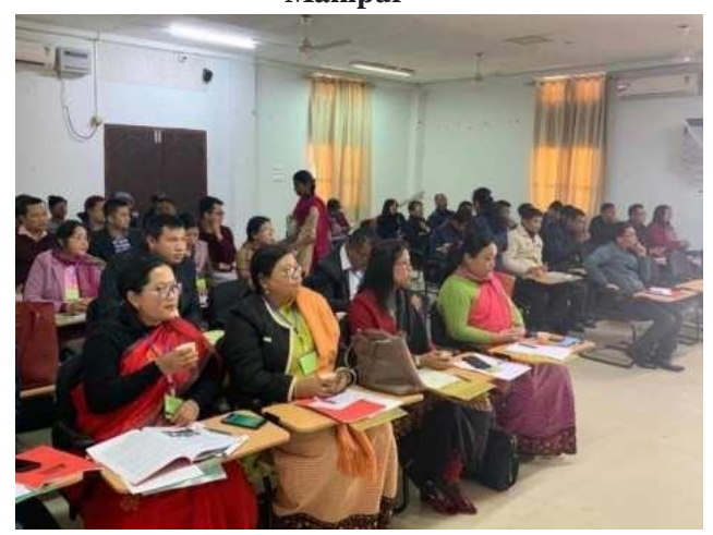
Participating Institutes Coordinator in the programme.