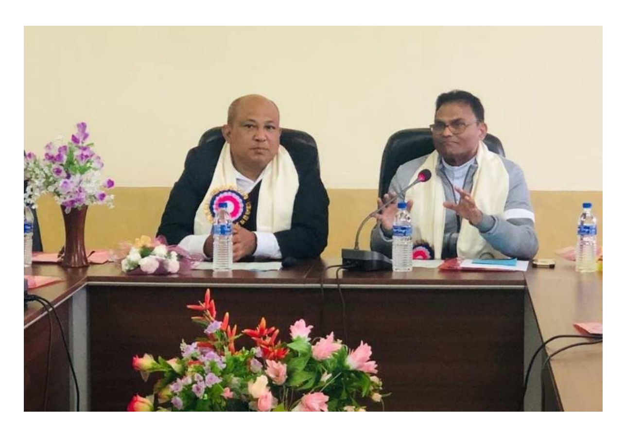
UBA Coordinator and Father of Don Bosco, College, Maram in the programme