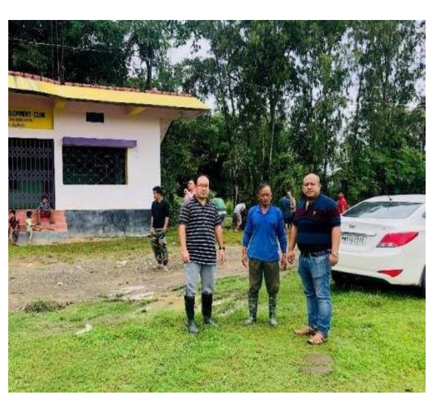
Swachhata Hi Seva campaign in the adopted villages