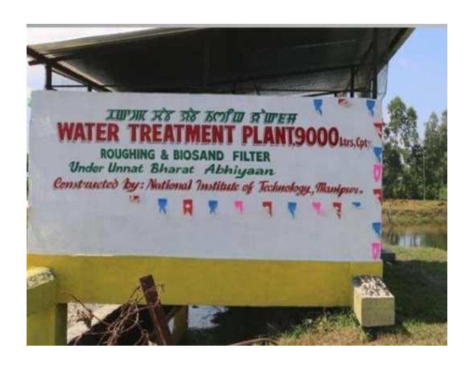
Constructed 9000 L Low Cost Water treatment Plant at Nambol (adopted village)

NIT Manipur under Unnat Bharat Abhiyan adopted 5 (five) villages at Nambol, Bishnupur District of Manipur namely- Nambol Makha, Kongkham Awang, Maibam Chingmang, Nambol Bazar &Koriphaba. A low cost 9000 L water treatment plant based on roughing and biosand filter was constructed at Nambol by NIT under UBA on 27th August 2016. The treatment plant serves the villagers within 3 km radius. Another 2nd water treatment plant was constructed and handed over to villagers of Maibam Chingmang in April 2018.