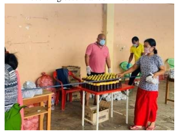
A villager picking up the Oil