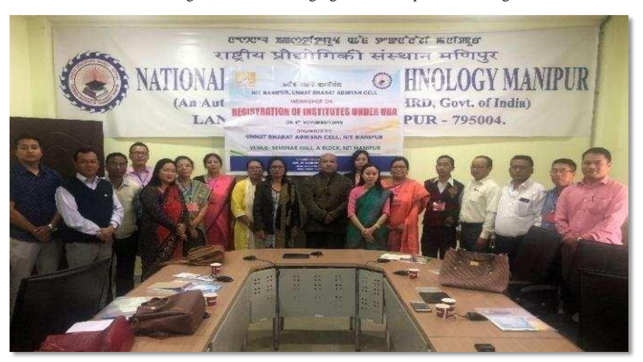
Registration for Participating Institute under Unnat Bharat Abhiyan for Imphal East District, at NIT Manipur.

As an outcome of this workshop, participants from Imphal East Colleges registered under UBA on the spot, thus increased in number of PIs in Manipur. The Registered PIs will further enhanced the vision of UBA in the villages, therefore bringing the developmental changes in the rural areas.