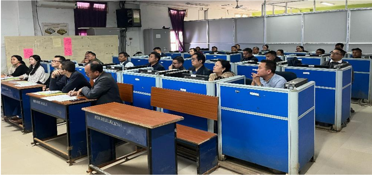
Registered Participating Institutes' Coordinators & Invited Faculties from colleges attending the program