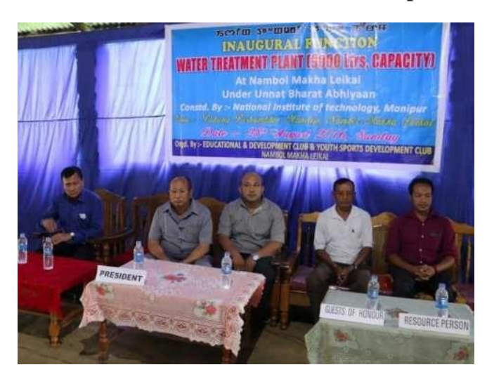
Special Invitees in the Inaugural function of the Water Treatment Plant at Nambol.