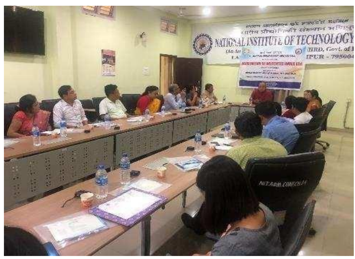
Interaction with the invited faculties during the programme.