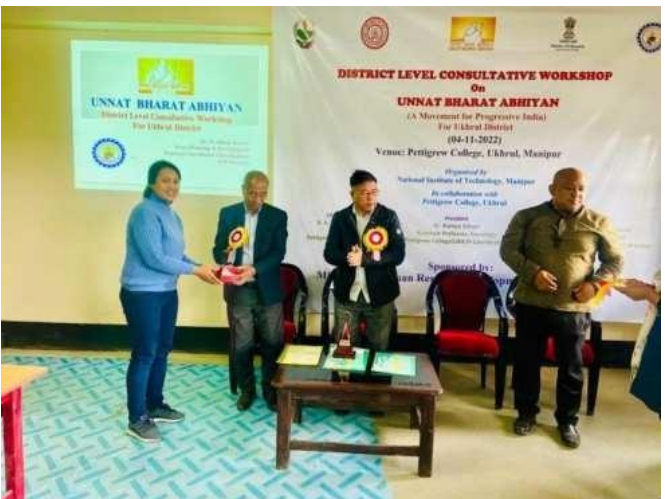
District Level Workshop under UBA for Ukhrul District at Pettigrew College, Ukhrul.