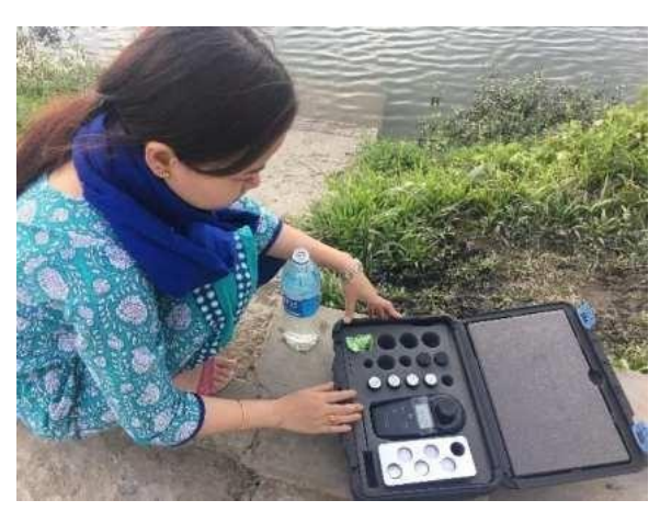
Analysis of the physical parameters of the pond water in the village