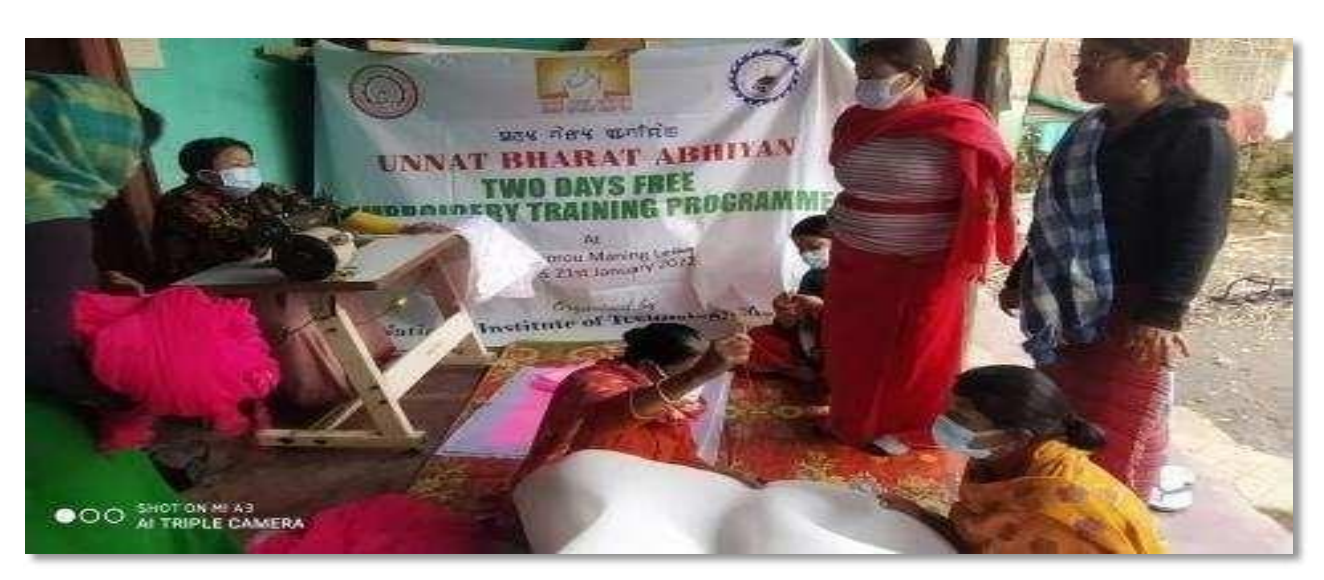
Two Days Embroidery Training Programme conducted on 20th & 21st January 2022 at Sangaiprou Maning Leikai