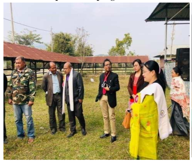
Site visit for contruction of treatment plant in the village.