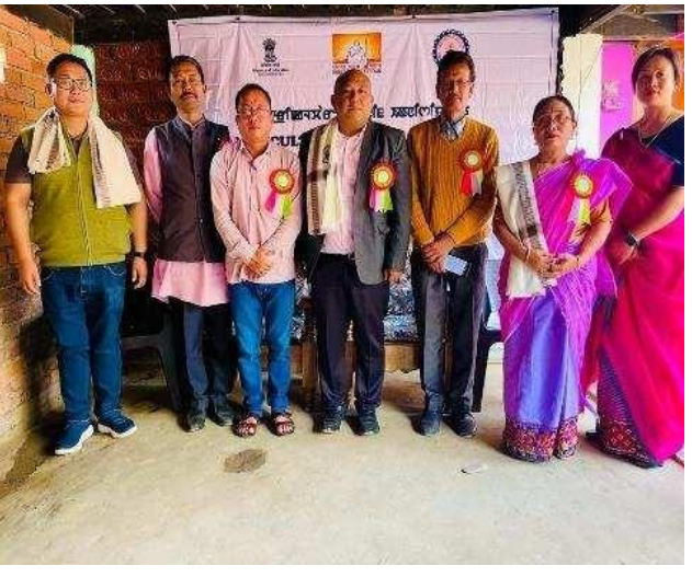
Dignitaries and Villagers in the Agricultural Relief Initiative programme at Pangaltabi Mayai Leikai on 25th Feb 2023