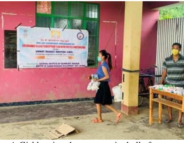
A Girl leaving the community hall after receiving essential commodities