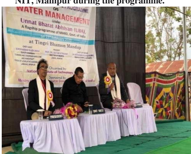
Delegates in the programme