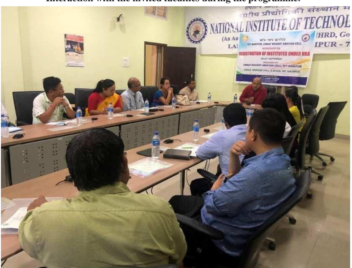
Queries interaction during the programme