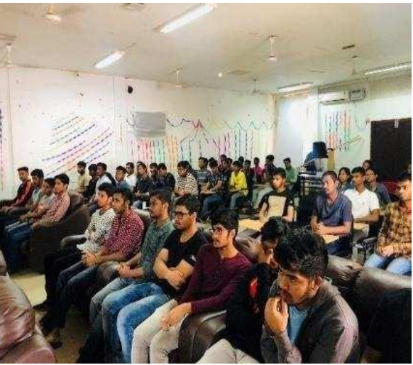
Presentation conducted by the students related with plastic related crisis