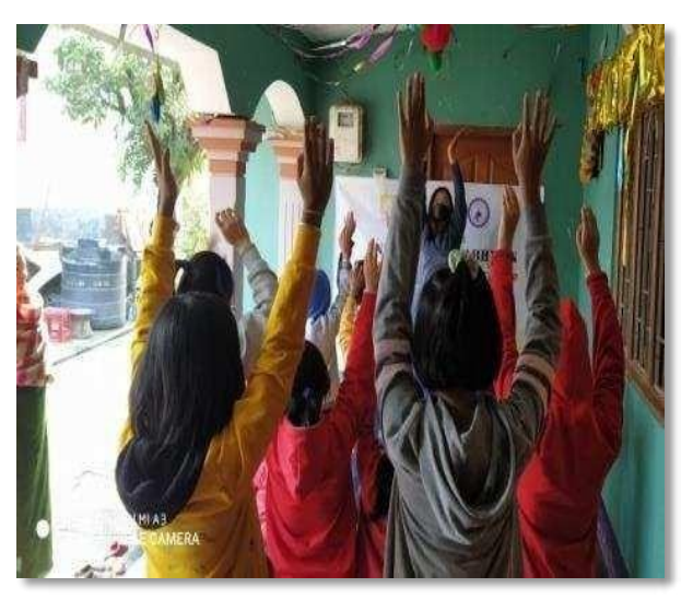
Covid awareness programme for the village children conducted on 15th January 2022 at Lukram Leirak Ward no.1 and on 18th January 2022 at Kongkham Awang Leikai