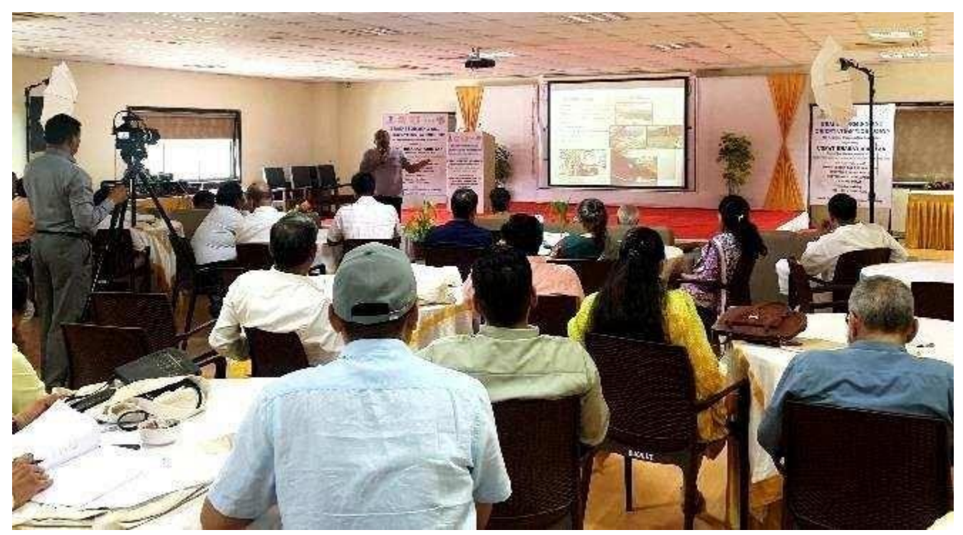
RCI NIT Manipur participating and sharing their experience in the "Brainstorming and Orientation workshop" on 9th-10th June 2022 in SVNIT, Surat