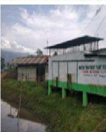
2nd Water Treatment plant constructed in Maibam Chingmang, April 2018