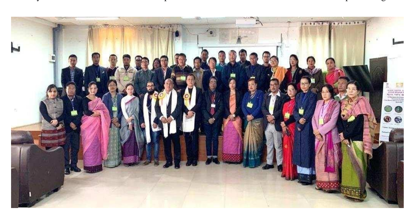
Orientation programme at NIT Manipur on 6th February 2020.

This programme has enriched the Participating Institute Coordinators and other Institute representatives to effectively participate in the holistic development in their adopted villages using eco-friendly sustainable technologies and local resource creating sufficient employment opportunities in the process, harnessing multifarious government schemes, customized use of existing technologies and use of knowledge as per the local needs, to improve the livelihood of the rural masses. The workshop has elevated the enthusiasm of the coordinators and other participants in the workshop to actively involve themselves and their expertise to execute the UBA mission in their adopted villages