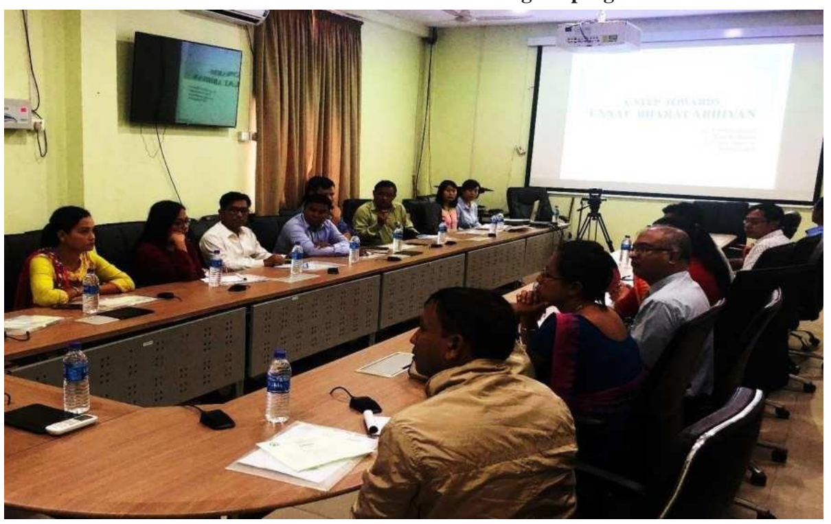
Queries interaction during the programme