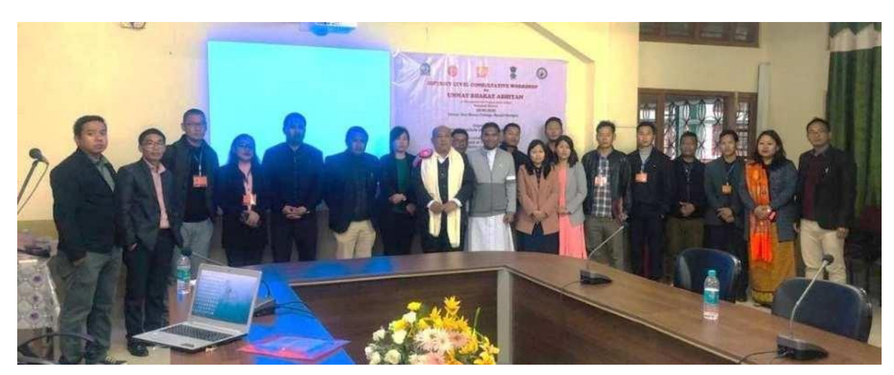
District Level Workshop under UBA for Senapati District at Don Bosco College, Maram on 26th February 2020

The workshop on "District Level Workshop under UBA for Senapati District" was organized on 26th February 2020 at Don Bosco College, Maram, Senapati. Considering the distance, such district level workshop was being organized at Don Bosco College, Maram. The workshop was attended by 20 faculties nominated by the invited colleges, organizing members from Don Bosco College including the UBA members of NIT Manipur. The workshop was performed in three sessions with the main objectives of the workshop. The methodology adopted was Invite colleges, Shared NIT Manipur9s accomplishment as PI under UBA, Registration of the colleges under Unnat Bharat Abhiyan and interaction. As an outcome of this workshop, the participated faculties from different colleges came to know about UBA, they were encouraged to register under UBA.