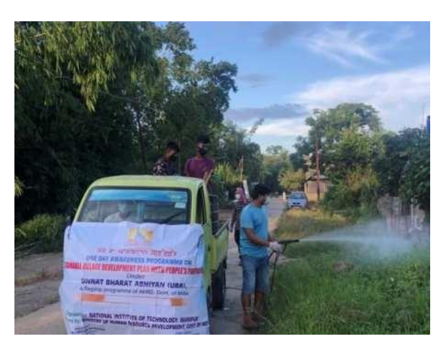
Spraying grass killing chemicals